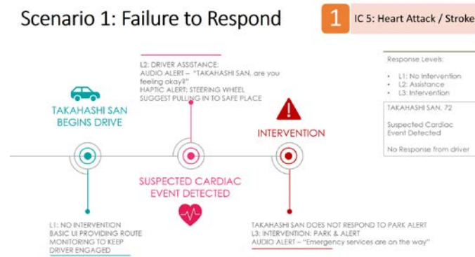
Fig. 1. Example Scenario: IC5, Heart Attack/Stroke (Failure to Respond)

The proposed multimodal logic has been worked out in relation to addressing the six IC's while considering concepts of older driver efficacy, assistance and adaptive automation. Several high-level user profiles and associated personae have been advanced and associated with the given IC's and scenarios. Figure 1 provides an example of the multimodal solution in relation to a specific IC, personae and scenario. Further research will address the detailed design of the driver communication system.