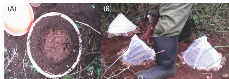
Figure 1. Experiment design: (A) a 1-L dung pat placed on top of a soil filled bucket and (B) pyramidal structures containing dung pats.