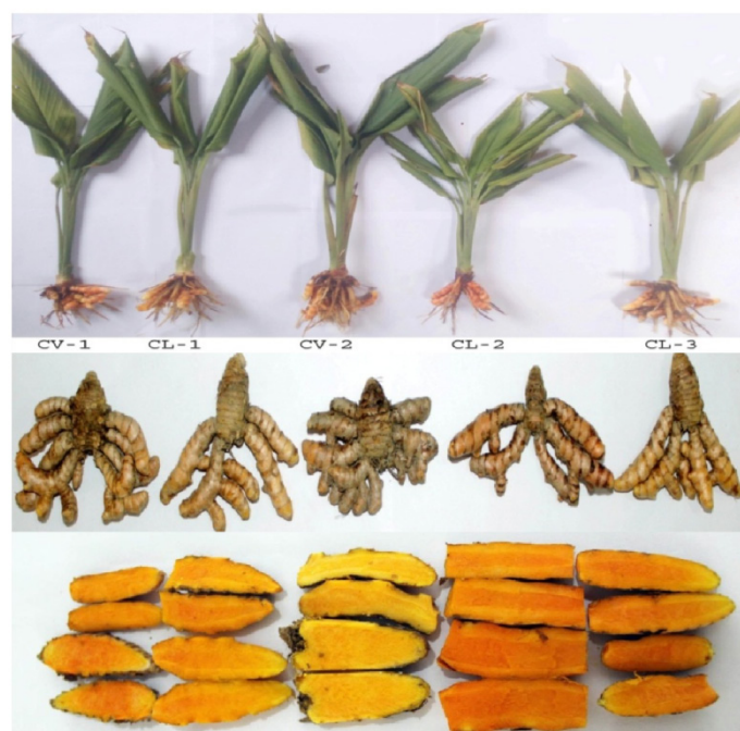
Figure 2. Fresh rhizomes with fingers and flesh color of different turmeric genotypes. CL 1 : “Mala Holud”, CL 2 : “Mota Holud”, CL 3 : “Patnai Holud”, CV 1 : “Dimla Holud” (BARI Holud-1) and CV 2 : “Sinduri Holud” (BARI Holud-2).

The recommended doses of manures and fertilizers (well decomposed cattle dung 5 t.ha -1 , Urea 304 kg.ha -1 , Triple Super Phosphate (TSP) 267 kg.ha -1 and Muriate of Potash (MoP) 233 kg.ha -1 ) were applied to the experimental plot (Anonymous, 2013). Total amount of cattle dung, TSP and MoP were applied to the plot during land preparation. Thereafter experimental plots were prepared following the design of the experiment. Turmeric fingers of each genotype were planted in the plots at a spacing of 40cm×25 cm on April 2017 following ridge method. Weeds and other unwanted plants were uprooted from the plot several times during the experiment period. Earthing up and top dressing of remaining urea were applied into two installments at 60 and 120 days after planting (DAP). Flood irrigation was applied after each fertilizer application. Water supply was stopped 2-3 months before harvesting of rhizomes and fingers.