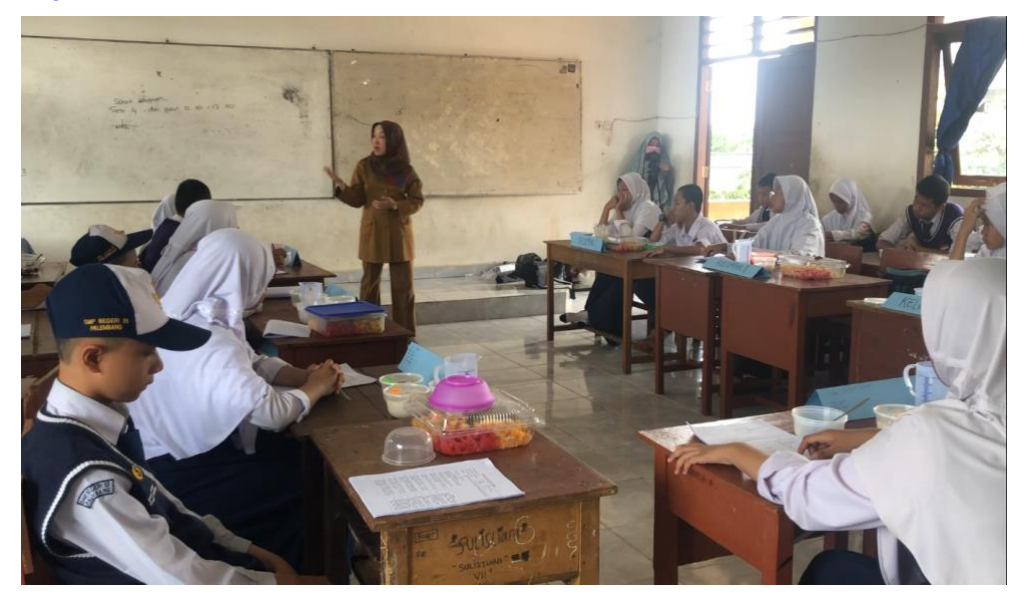
Figure 9. The second day of learning project

The second day of learning was the stage of implementing the product or making fruit salad recipes. The teacher explained the previous lesson, namely designing recipes fruit salad based on the questions given in activity 1. Next, the teacher asked the students to make fruit salads and write recipes for the activity. In the process of making fruit salad, the students worked in the previous group. The teacher reminded the students to use the equipment brought and the duration for making fruit salad, shown in Figure 9.