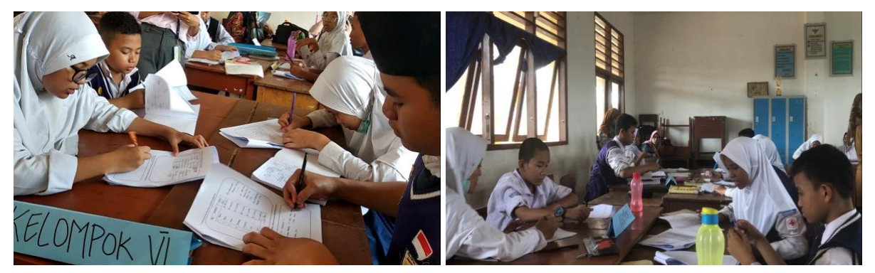
Figure 2. Students' answer in the activity 1

When the students worked on activity 1, the teacher monitored them according to the stage of the PjBL learning model. The teacher may not intervene with the students. If there were questions from students who did not understand, the students were asked to ask their peers so that collaboration between groups occurred (Figure 2). After the learning was completed, the use of a project-based approach was carried out in 2 stages with the first stage of helping students to become competent enough by developing knowledge from an increased understanding of concepts and the second stage of the skills needed to make products independently (Kokotsaki, Menzies, & Wiggins, 2016).