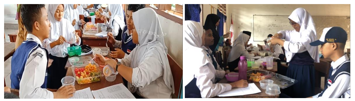
Figure 10. Students make the products

The students collaborated together in the process of making fruit salad. The students compared the making of fruit salad to the planning stage as the implementation stage at that time, as shown in Figure 10.