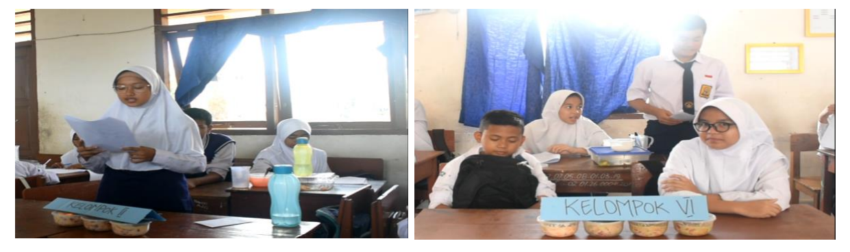
Figure 12. Students present the results of the product

The final stage was to assess the results of the products by presenting the results of their work, namely fruit salad with the recipes that have been made. The teacher asked questions about the process and product results. Figure 12 shows students presenting their work.