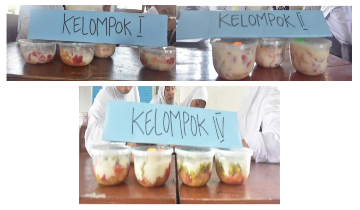
Figure 11. Students display the products

The students published their product work, namely fruit salad, to classmates to be presented and assessed by the teacher. Figure 11 shows students displaying the product.