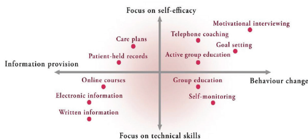
Fig. 2. Continuum of strategies to support self-management

(17) Reference: Effectiveness of Registered Nurses and Nurse Practitioners in Supporting Chronic Disease Self-Management. A Public Health Agency of Canada Funded Project. March 2012.