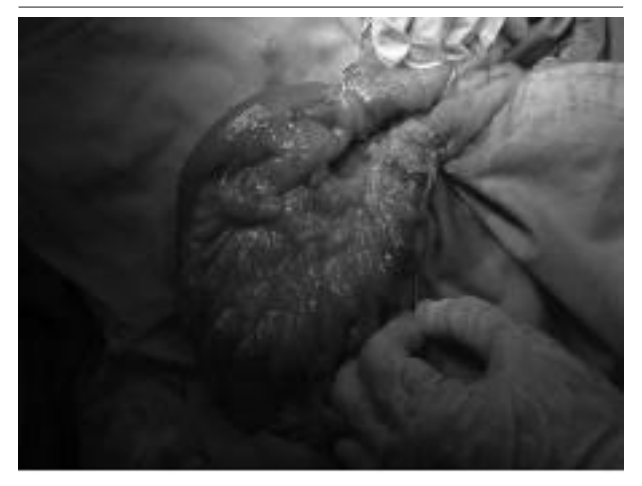
Fig 5. Standardized technique for Sigma resection/ anastomosis with L cutter 55

The study was approved by the local ethics committee and a written informed consent was obtained from all patients.