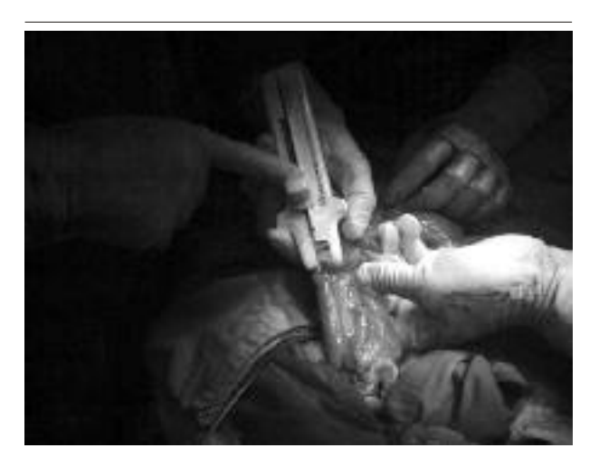
Fig 6. Standardized technique for Sigma resection/ anastomosis with L cutter 55