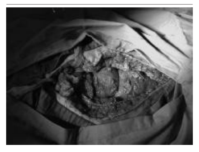
Fig 3. Feculent Peritonitis from Perforated Colon Diverticulitis treated with Laparostomy.

Hinchey's classification of CDDC is including a phlegmon(stage Ia), localized abscesses (stages Ib and II), free perforation with purulent (stage III) or feculent peritonitis/Fig 3,/(stage IV)/3,10/.