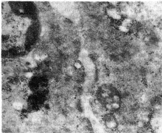
Fig.1. NSMCs connected with their bodies TEM x 30 000

The manner of contacts between neointimal smooth muscle cells (NSMCs) of the autogenous saphenous vein grafts determine to a large extent the capability of that layer to carry out one of its basic functions - the buffer one. We studied an operation material from 10 patients with occlusive lower limb atherosclerosis in which reversed great saphenous vein had been applied for arterial bypass grafting. Material was taken during the 2 nd operation performed in different time intervals (7-24 months) after first one. We used routine histological and electron microscopic techniques (3). NSMCs contact each other either with their bodies or with thin projections varying in length and with different space orientation. When cells contact with their bodies (fig.1) their basal lamines become thin or disappear and both cell membranes come closer by opposite large based cytolemmal evaginations. They form contact gaps 20-40 nm wide filled up with