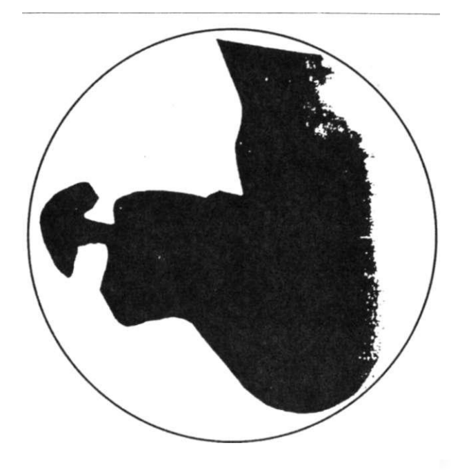
Fig. 3. Typical x-ray image of valvular pyloroplasty

These techniques are characterized, however, by lack of pylorus closing capacity and weaker antropyloric antireflux barrier.