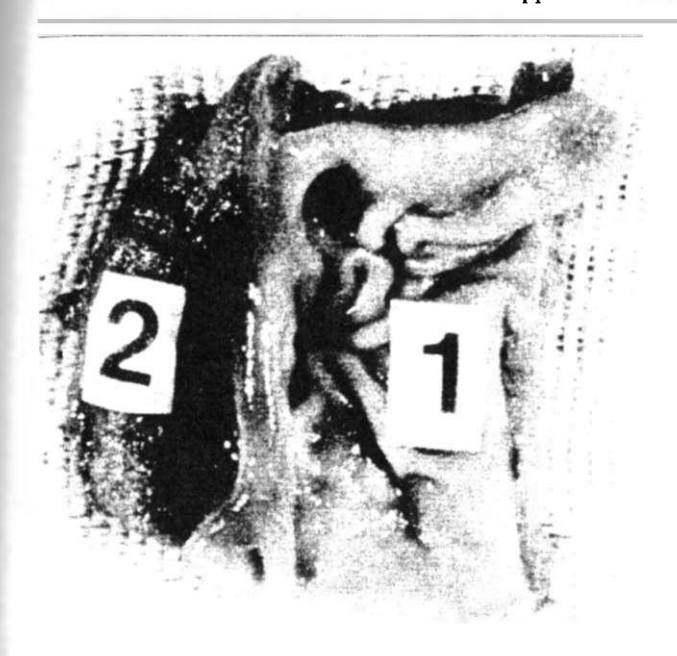
Fig. 2. Canine gastric and duodenal mucosae one year after operation. Preserved appearance of the mucous fold; 1 – stomach; 2 – duodenum

This roentgenological structure in the pyloroplastic region remained constant even two years after operation. There were no x-ray signs of gastric stasis and dilatation in any patients. It was noteworthy that prior to operation, two patients presented with subcompensated gastric dilatation because of ulcerative pyloric stenosis. There were, however, no symptoms of stenosis one year after operation. Duodenal dyskinesia with antiperistalsis was roentgenologically proved in seven patients. It should be mentioned that, preoperatively, four of them complained of duodenal dyskinesia and severe duodenogastric reflux as well. Postoperatively, the duodenal dyskinesia persisted to the same extent while the duodenogastric reflux was hardly detected in one patient only.