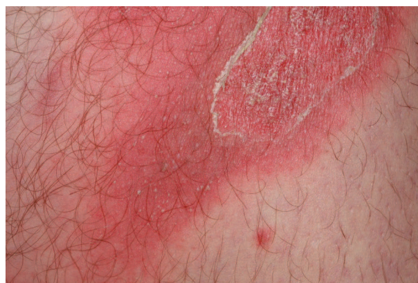
Fig. 1. Multiple sterile pustules on erythematous background

AGEp presents with the acute occurrence of oedematous erythema covered by dozens to hundreds of pinhead, non-follicular, sterile pustules (Figure 1). The rash has a predilection for the main folds, but widespread distribution is common. Less often AGEp could manifest with atypical type of lesions including face oedema, purpura, blisters or targetoid lesions (39) (40). Involvement of mucous membranes is uncommon, usually mild and restricted to one body site (most commonly the oral cavity). Systemic symptoms almost always accompany the cu-