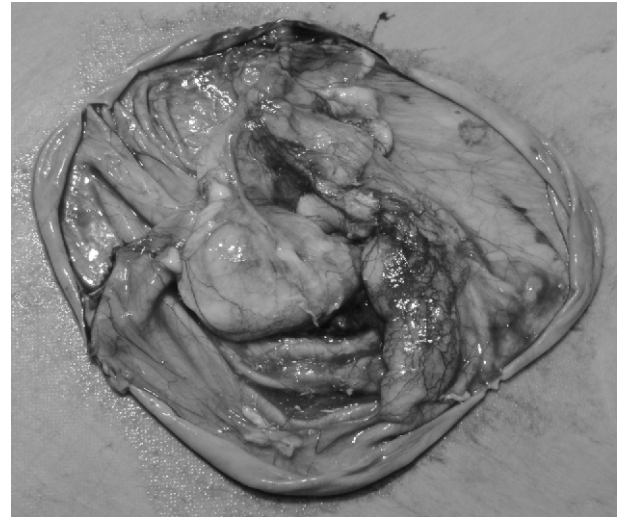
Figure 4. View of a large dermoid (our case).

The final histopathological report revealed a benign mature cystic teratoma with hemorrhagic necroses.