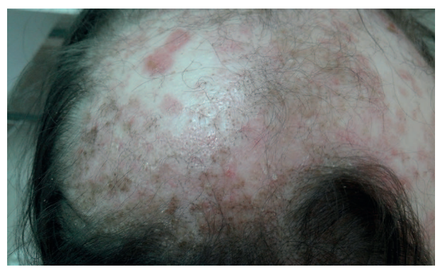
Fig. 1. Diffuse atrophic plaque with occasionally spared follicles and perifollicular erythematous papules with tiny peripheral scaling at the edge of the area involved

were constant subjective symptoms. No histological examination has been done so far. At the time of the physical examination diffuse atrophic plaque with occasionally spared follicles was involving the parietal zone. Perifollicular erythematous papules with tiny peripheral scaling demarcated the lesional borders (Fig. 1).