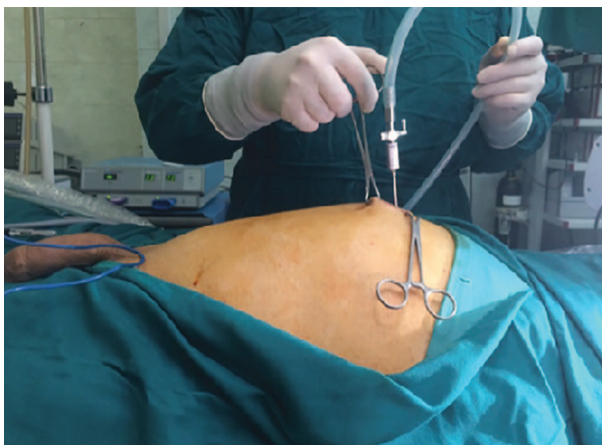
Fig. 1. Fan-shaped transperitoneal placement of 5 trocars for laparoscopic radical cystectomy

The selection of suitable patients for LRC is an