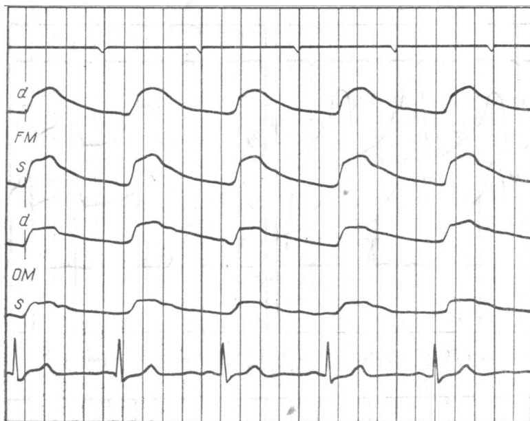
Fig. 3: REG of a patient with expressed A of the BV

III rd group — 20 cases. Well-expressed atherosclerosis of the cerebral vessels. Bilateral plateau and archwise-changed REG-peaks, also totally flattened polydicrotic waves, are established. The time-period of the ascendent part of the pulse-curve is averagely equal to 0.13 sec. and the ratio of