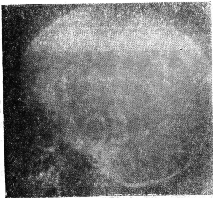
Fig. 4. Cranial metastases of osteolytic type.