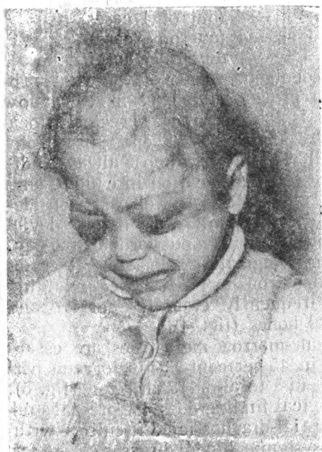
Fig. 1. Palpebral oedema with haematoma, exophthalmus.

symptoms of the illness for a long period of time. Febrility is observed in 18 children, abdominal pain with intraabdominal localization — in 15, appetite loss — in 15, polyadenopathia — in 14, palpebral oedema with haematoma — in 9 (fig. 1, 2); hepatomegalia — in 9, headache, diarrhoe and bone pains — in 7 each, exophthalmus 6 (fig. 1, 2), subcutaneous lesions (fig. 2), palpable tu-