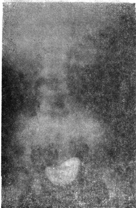
Fig. 3. Venous urography — the right kidney is dislocated in external and caudal direction by neuroblastoma originating from the corresponding adrenal gland.

Roentgenography of the whole abdomen proves seldom a tumour shadow which is later on more precisely localized by echoscopy and venous urography (fig. 3). The latter almost always indicates a renal dislocation in caudal and lateral direction as well as a considerable deformation, rotation and deviation of ureters with outwards convexity. Roentgenologically, bone metastases show numerous osteolytic foci involving most frequently cranial, pelvic and femoral bones (fig. 4).