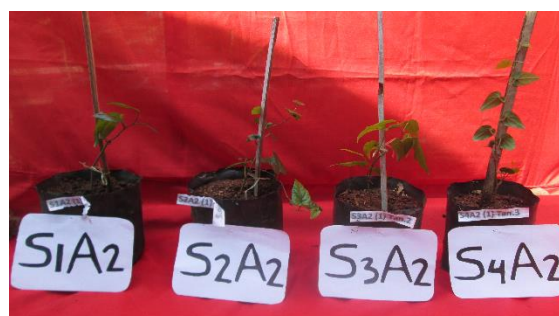
Figure 2. Long pepper plant performance three weeks after planting (WAP) with different growing media compositions.