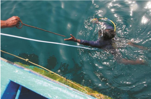
Fig. 1 — The spear is handed over to the diver