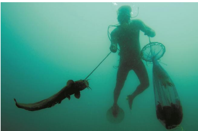
Fig. 3 — A surface-supplied diver with his catch

fishing is one of the common artisanal fishing methods in many countries 9 and has been reported to cause significant damage to the fish communities 10-13 . Generally breath-hold divers cannot do spear-fishing effectively due to the limited time under the water.