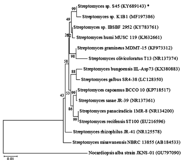
Fig. 3 — The phylogenetic relationship of the potential Streptomyces sp. SACC4 based on 16S rRNA gene homology. The tree was constructed using the neighbor-joining method with pairwise-deletion model analyses, which were implemented in the Molecular Evolutionary Genetics Analysis (MEGA), version 6.0 program. The resultant tree topologies were evaluated by bootstrap analysis based on 1000 replicates. Nocardioopsis alba JKNS-01 was used as out group. Scale bar indicates the number of substitutions per site.

Terrestrial soil is the richest source for actinobacteria notably Streptomyces . Using specific media and addition of antibacterial and antifungal agents play an important role in successful isolation