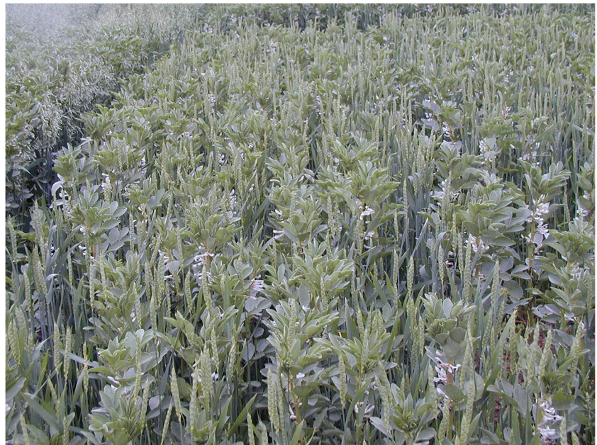
Fig. 1 Intercrop of spring wheat ( Triticum aestivum L.) and faba bean ( Vicia faba L.).