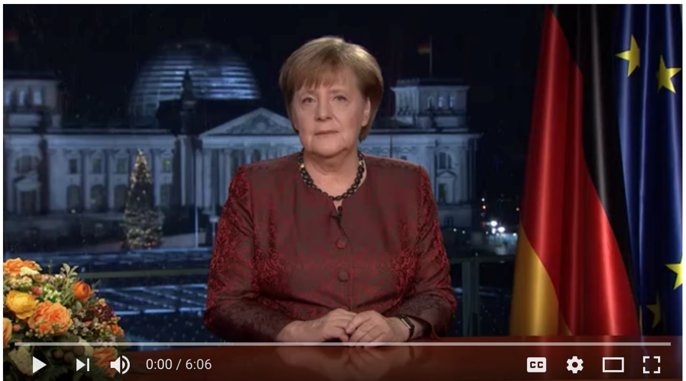
German chancellor Angela Merkel's New Year's speech for 2018. https://www.youtube.com/watch?v=PfuKMpm6X8U

So, a zoom out at the end of a political speech or debate on television is quite standard procedure. One example of this is the German chancellor Angela Merkel's New Year's speech for 2018. During the entire main part of the 6 minute long speech the camera stays zoomed in at a fairly close head-and-shoulder shot. There are, however, within this main setting some very small movements in the zoom, hardly noticeable unless one runs the recording fast forward or backwards. This is not due to sloppy camera work, on the contrary it is just a skilled way of adding a bit of life to an otherwise rather stiff appearance of the speaker. These small adjustments - movements almost as if the camera was slowly breathing or adjusting its stance - can be seen in many other examples of portraying a politician on TV (even as early as 1969 as we shall soon see).