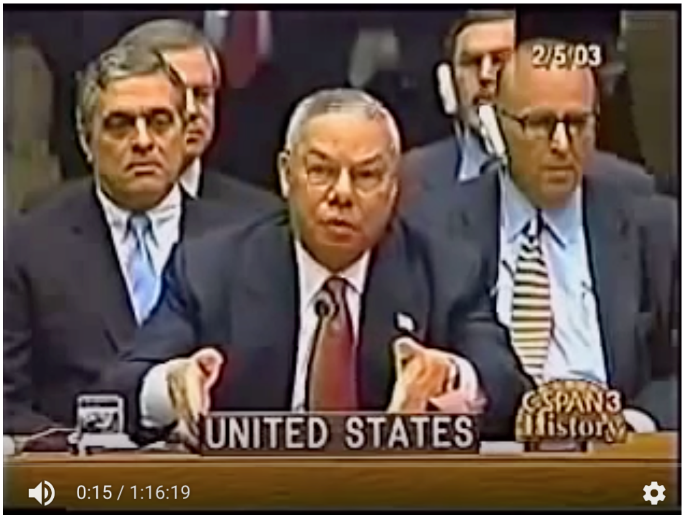
Colin Powell, Feb. 5, 2003 http://www.youtube.com/watch?v=Nt5RZ6ukbNc