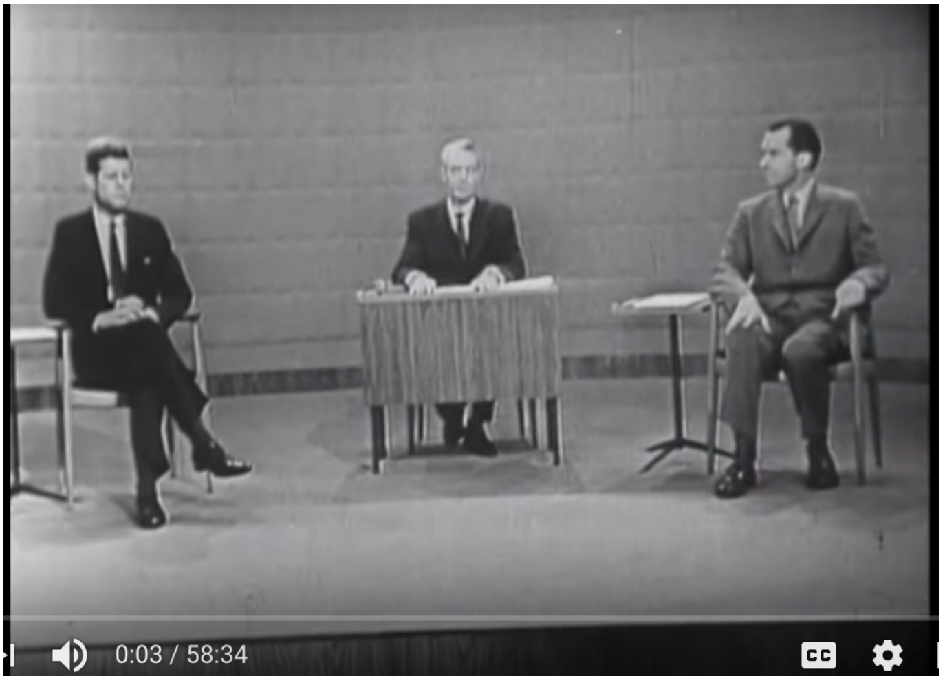
Kennedy versus Nixon 1960 presidential election debate.

The debate between John F. Kennedy and Richard M. Nixon in 1960 up to the US presidential election has become renowned as the first live broadcast of a major political duel, and one that proved the new television medium to have a decisive influence. Even though it has later been questioned if the two polls were actually comparable, the story goes that television viewers favored Kennedy whereas radio listeners favored Nixon: "Television audiences thought Kennedy won the debate by a landslide, while radio audiences thought Nixon won it by a landslide" (Power).