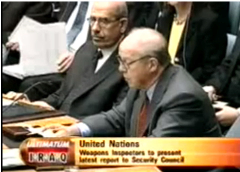
Hans Blix, March 7, 2003

Hans Blix we can see was filmed from above and from his left side in semi-profile. This means that he is not facing the viewers, he is not in eye contact with the viewers and not at the same level, he is being observed and looked down upon in a literal sense. This is significant because the metaphorical sense of “being looked down upon” (i.e. to be seen as inferior, unimportant, disliked, or irrelevant) may very well follow, this may very well be the immediate, instinctively and culturally conditioned reaction of the audience. This “downgrading” point of view of the camera is not supporting, but detracting from any ethos the speaker may have had in advance and in the situation, he is being framed not as an authority but as a partial voice in a debate, almost like an outsider commenting on something to someone else, not as an important person directly addressing the viewer.