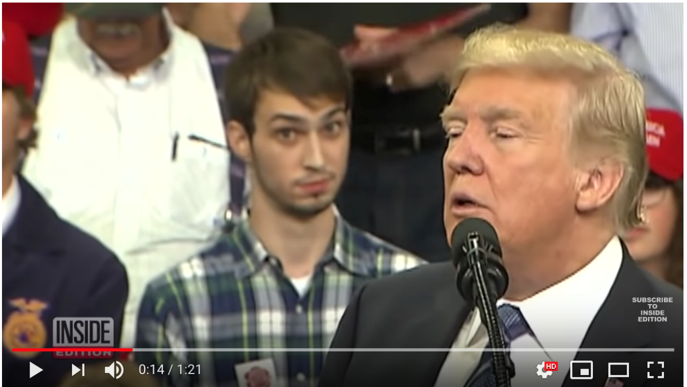
Smirking “Plaid Shirt Guy” upstages Donald Trump, Montana, Sept. 2018. https://www.youtube.com/watch?v=J4pcZdJcpbs