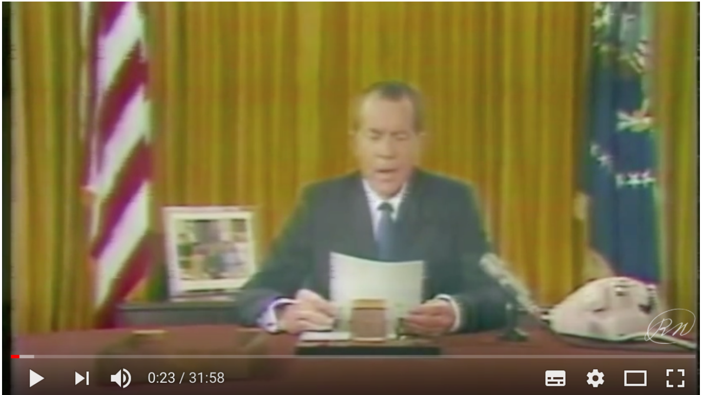
Richard M. Nixon's Great Silent Majority speech, 1969. https://www.youtube.com/watch?v=TpCWHQ30Do8&t=752s