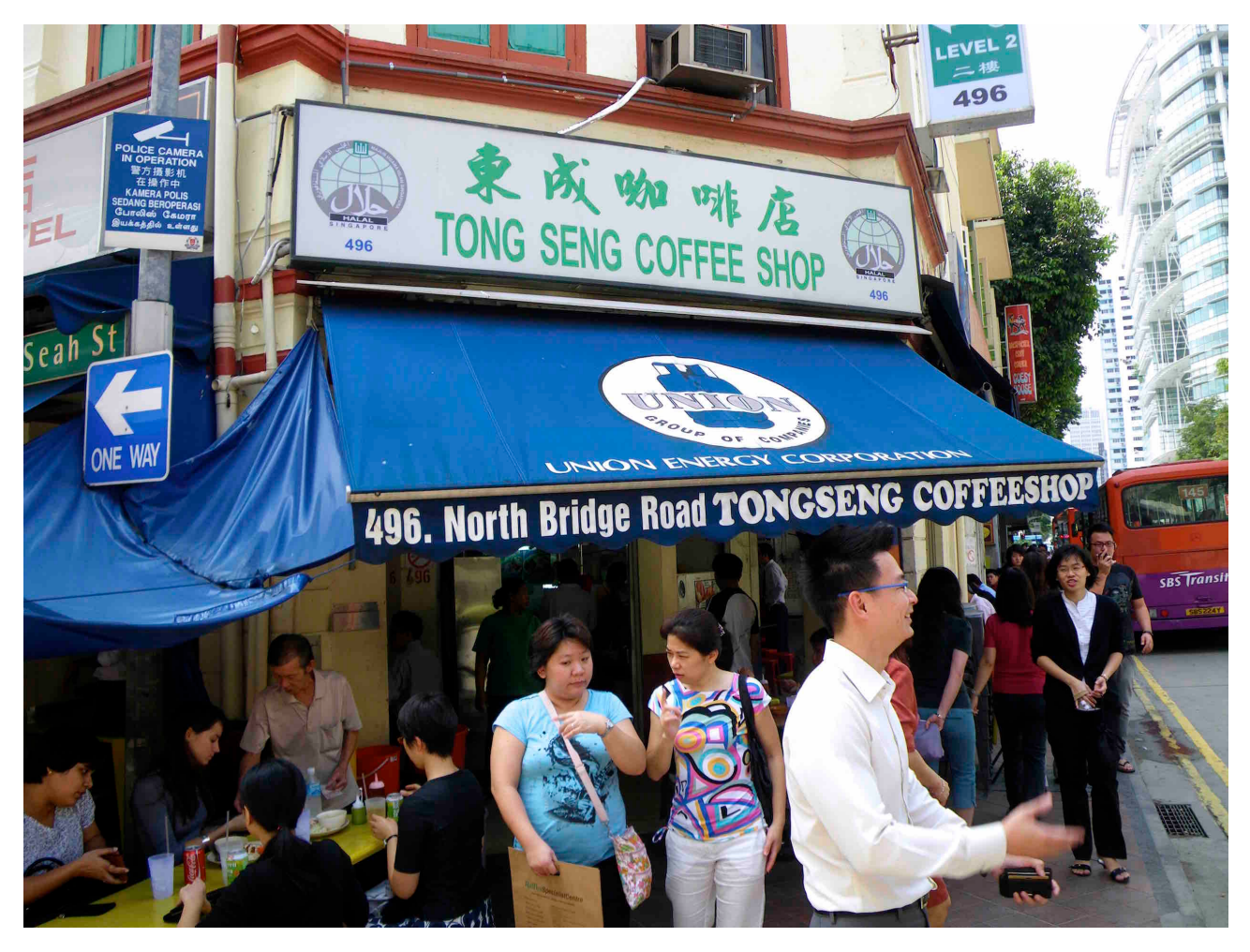
Figure 5. A Chinese coffee shop.