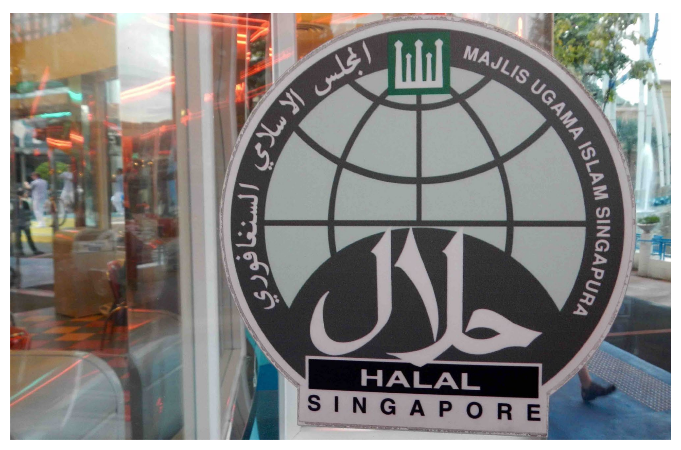
Figure 1: The MUIS halal logo on a restaurant door.