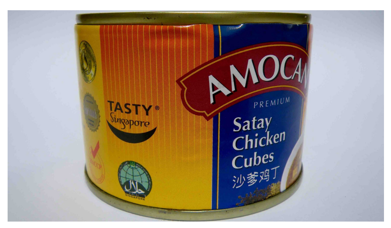
Figure 7. Amocan Satay chicken.

meaning that in supermarkets the roles of and relationship between MUIS as a regulatory institution and FairPrice have been settled.