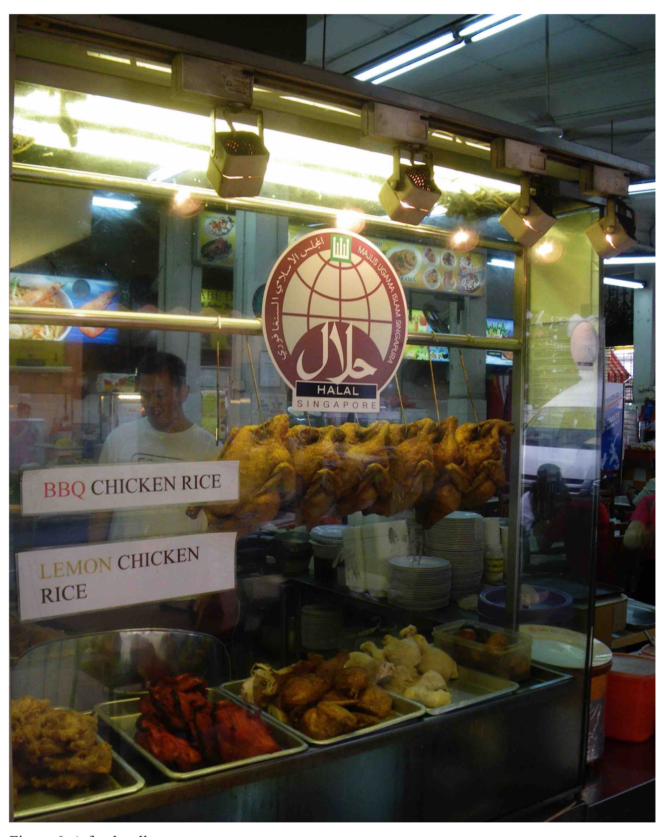
Figure 6. A food stall.