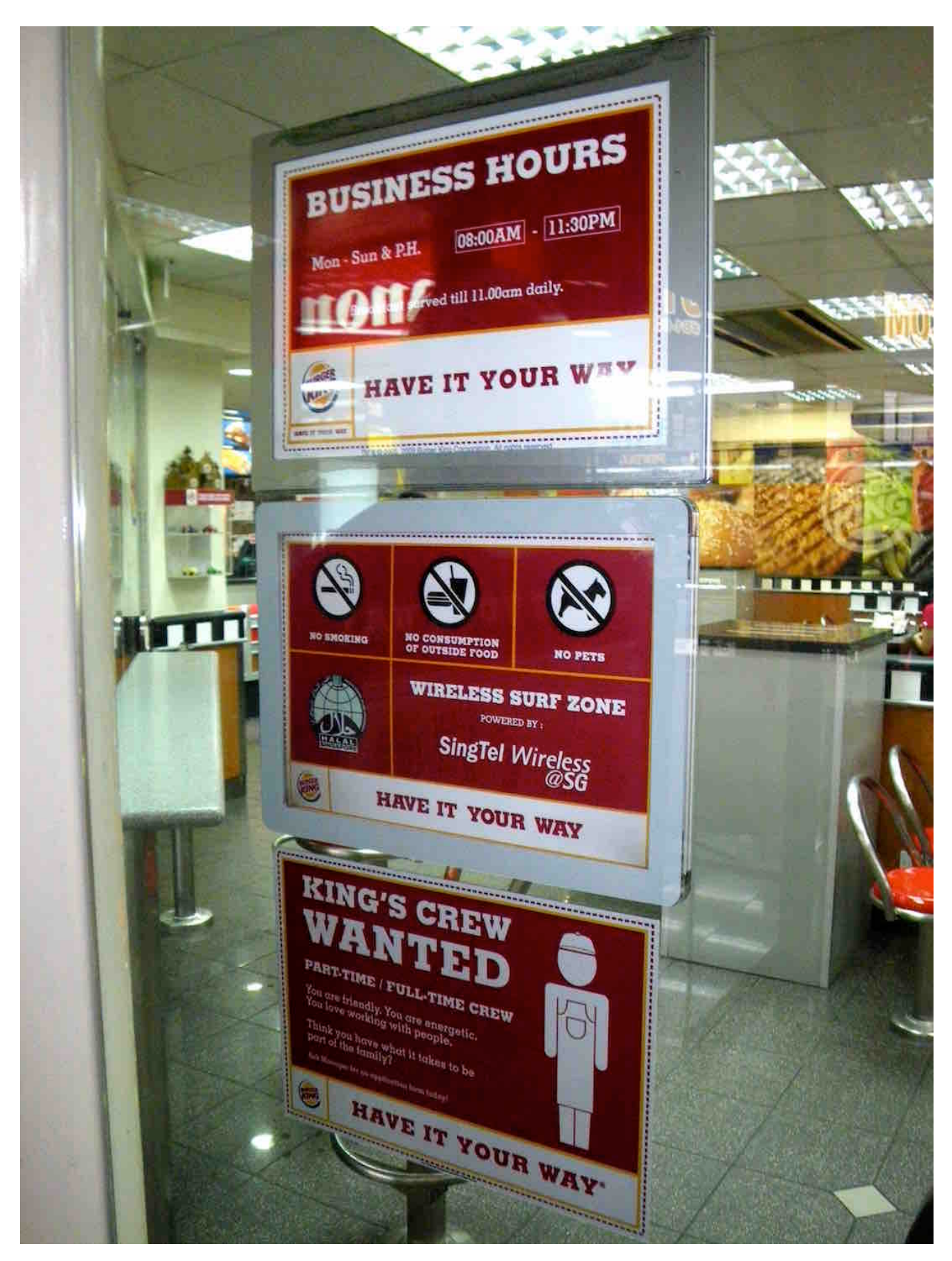
Figure 4. Burger King.