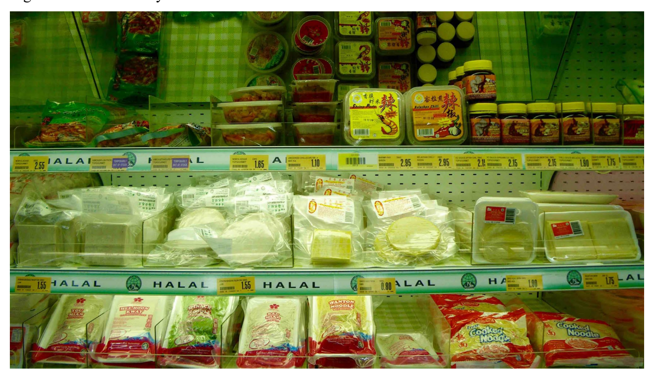
Figure 8. The halal counter.