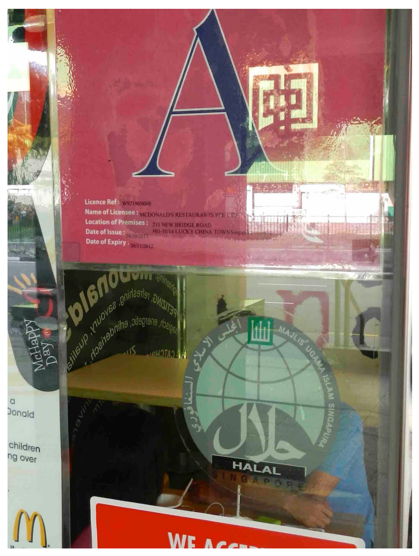
Figure 3. A McDonald's outlet in Chinatown.