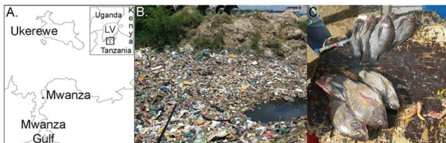
Fig. 2 Map of the Lake Victoria study area showing the Mwanza region. (a) Nile perch and Nile tilapia were purchased from the harbor market at Mwanza (regional capital). The local fishing area extends across the Mwanza Gulf and to Ukerewe Island. Inset Lake Victoria (LV) bordered by Uganda, Kenya, and Tanzania. The Mwanza region located on the southern shore of Lake Victoria is highlighted. (b) Urban waste in Mwanza, including plastic debris, collects in drainage ditches which are a potential source of plastic pollution in Lake Victoria. (c) Nile Tilapia used in this study (photographed prior to dissection) were purchased from the market

( Oreochromis variabilis ) and Singidia tilapia ( Oreochromis esculentus ), which subsequently disappeared from parts of the lake [49, 50]. Thus Nile perch and Nile tilapia have established themselves as dominant commercial and ecological species and therefore represent logical choices by which to monitor MP pollution in the area. Moreover, their differing feeding habits could provide additional information by which to contextualize plastic ingestion. Nile perch are predatory fish feeding on haplochromine cichlids and gastropod snails, whereas Nile tilapia are omnivorous with a diet consisting of plankton and fish.