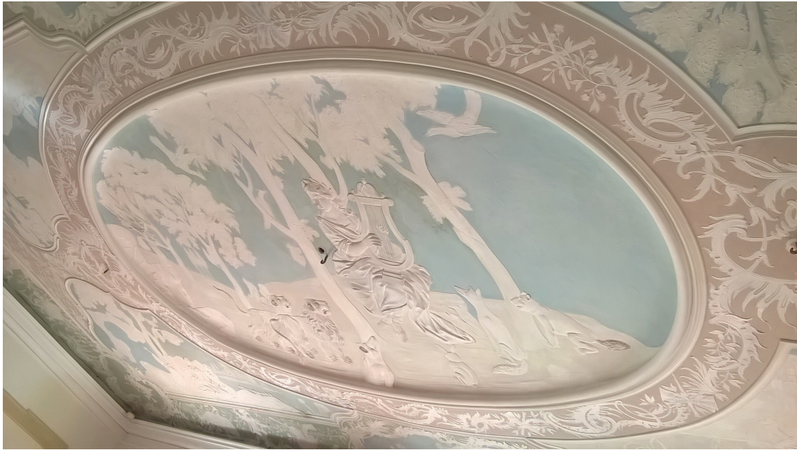
Figure 3: Orpheus playing the lyre that enchanted all creatures.

His cosmopolitan taste explains the naming of the Hungarian Karl Mardel as the architect for the estate that articulated productive and leisure areas, besides taking advantage of flowing brook and viewpoints that once allowed force lines, linking Sintra and Arrábida mountains. As Dias (1993) sustains, Mardel “was inspired by the landscapes of Vaux le Viconte and Versailles (...) and the philosophies of André Le Nôtre – grand architect of Louis XIV (...). Naturally Oeiras is smaller” (19). Other important artists included the Italian stucco master Giovanni Grossi, and the Portuguese (sculptor) Machado de Castro and (painter) André Gonçalves. Grossi’s stuccoes are everywhere: from the chapel to the Grand Hall, from intimate leisure spots like the Music Room (where lessons for the children and soirées for the family were organised) to Carvalho e Melo’s study (whose ceiling reveals Mercury flying over a building site, an allusion to Lisbon’s reconstruction works, but the guide might recall the Minister’s fine lacquered desk). Grossi’s artistry meets Castro’s skills in the Dining Hall, where the stuccoed groin vault is embellished with Carrara marble statues, besides Rococo glazed tiles with scenes of 18 th -century indoor and outdoor meals. There the guide might lead visitors to find the pannel were coffee and chocolate are being served, or the stucco cartouche where a servant wearing a turban waits on a lady.