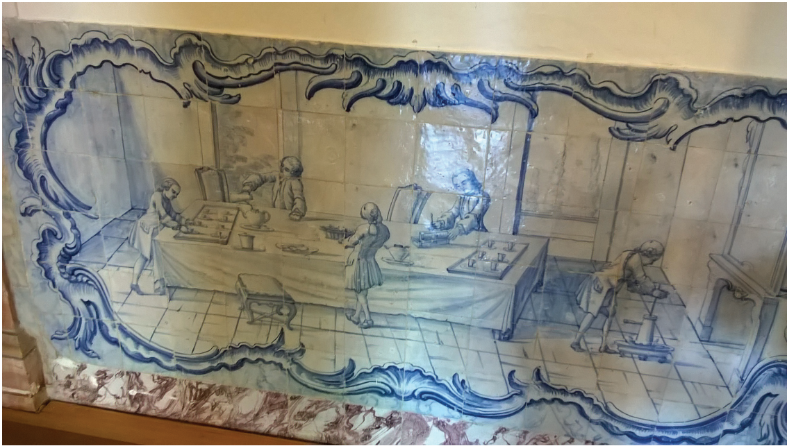
Figure 4: Tiles depicting 18th-century exotic beverages served in the Dining Hall. (Authors' collection)

fate. The already known as Marquis of Pombal was sent into exile to the namesake territory in central Portugal, but in the 1830s the victory of liberal principles would praise his reforms. By the early-20 th century his offspring sold Oeiras' estate to Artur Brandão, a businessman who split it into three sections before selling them. For decades the silhouette of the mighty palace resembled a ghost of Ages past in the quiet panorama of the downtown area, until the early-21 st century. Decades of mismanagement took its toll on palace and gardens, hence the continuous renovation works at hand, especially considering the "many tile panels from different periods of the 18 th century and of great artistic and historical quality that presented several frailties and pathologies (...). Therefore, to preserve (...) is to carefully save and maintain in good condition our heritage". (Fernandes, 2016: 41)