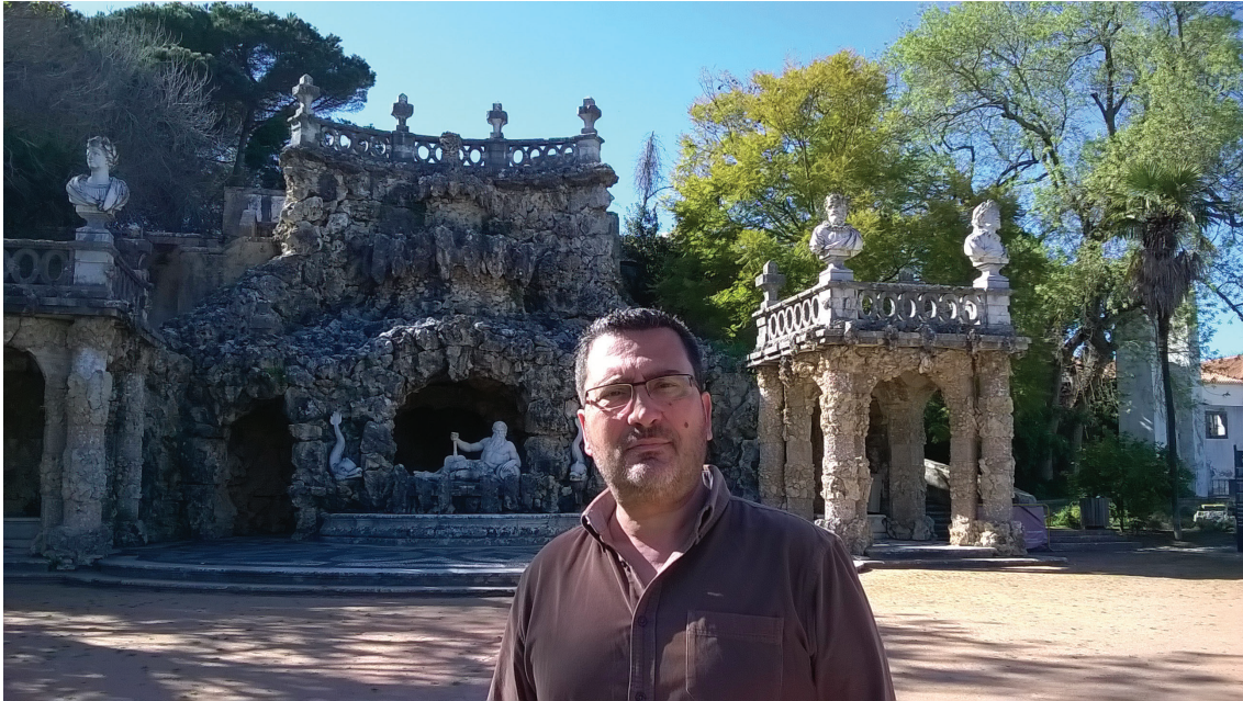
Figure 5: One of the authors'/Guides near the Classical Poets' Cascade.

sold at the palace's souvenir shop from cloth dolls to miniature tea sets, and junior astronomy kits.