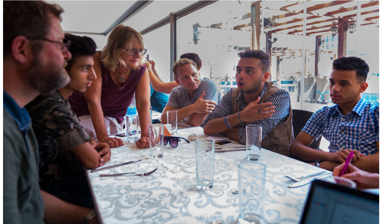
Intense group work, Seidon 2017

Upon arrival in Beirut, we had a group formation exercise where we split the Danish group into 4 groups. The idea was that after visiting our partners in and around Beirut we would all meet up again and take stock of what we learned throughout the day and how we can ensure to pass on our lessons learnt to others in future. Members of each group were split across professional positions. Once we met up with our partners in DPNA,