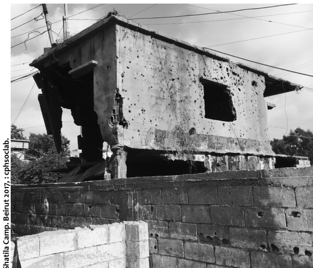
Shatila Camp, Beirut 2017; : cphsociohab.

The tour in Shatila started on a dirt covered parking space surrounded by remnants of house walls and burnt out cars and houses. We were quickly led past an attempt at in-