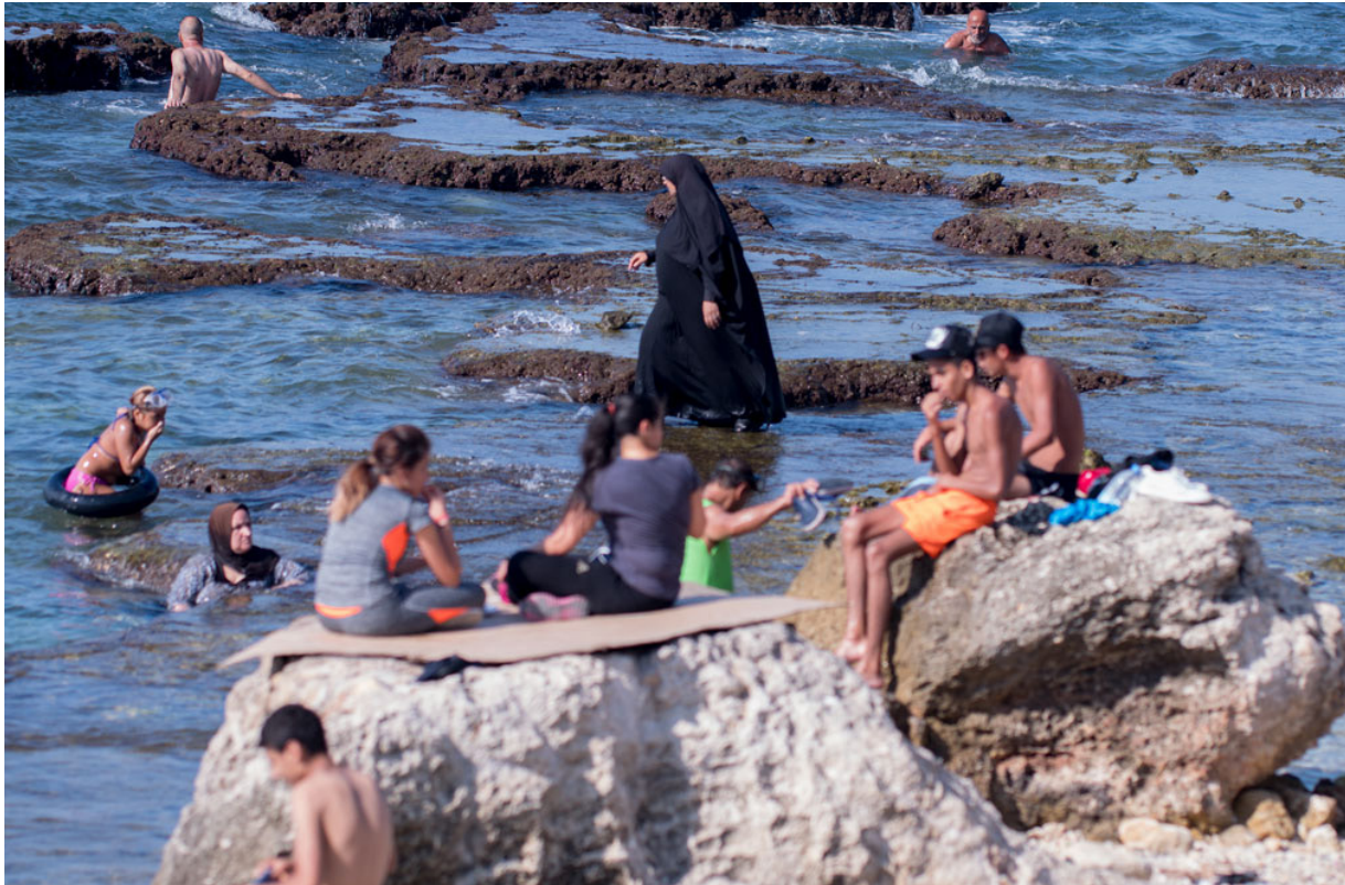
The Corniche, Beirut 2017, photo: cphsoclub.

set up meetings with the social worker, etc. In particular, this applies to cases where there is a need for “damage control.”