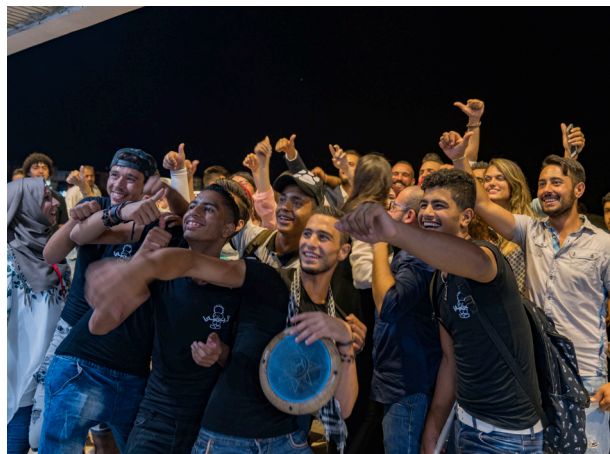
Volunteer youth, Bussma Y.C., Seidon 2017

The house is maintained by a permanent staff consisting of a centre coordinator and his/her assistant, an assistant teacher, a permanent project evaluator and two psychologists, in addition to two technical and administrative staff that handle the bookkeeping and secretariat functions. The psychologists are clinically trained and work with the young people either directly or indirect-