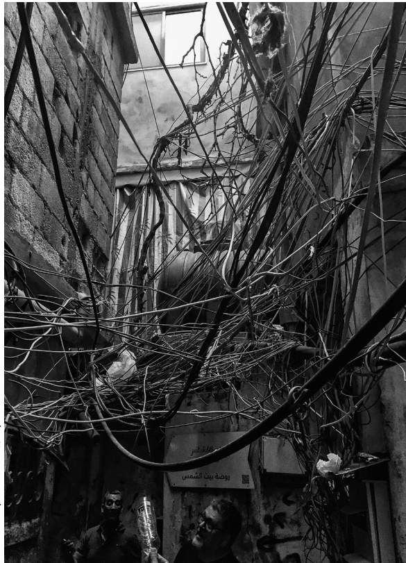
Shatila Camp. Beirut 2017.