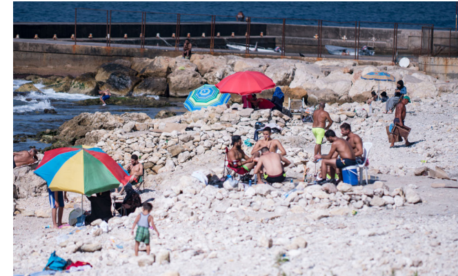
Family unity, The Corniche- Beirut, 2017, photo: cphsoclub.

The field work revolved around the deconstructed family and its significance on the young people's ability to cope with their own circumstances. It quickly became clear to all participants that the significance of the family, while known, was being underestimated in their daily work. By focusing on the absence of the head of the family, the participants were given insight into the significance of growing up in a "weak state" where one's needs were met by the family, the network and through relationships in the local community - and not by the public sector.