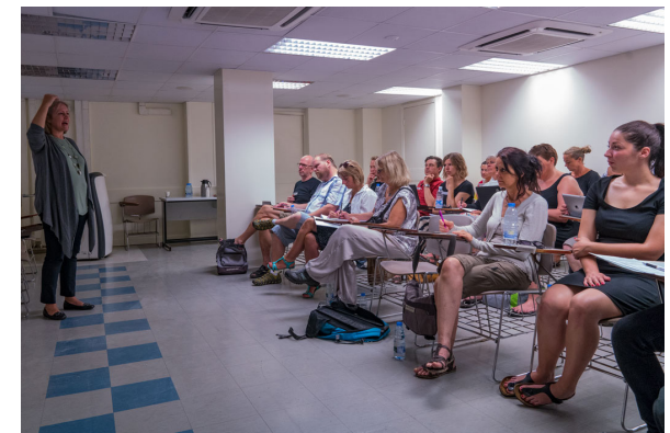
Lecture at LAU. Beirut 2017

The project encourages actors to investigate and (possibly) work towards the opportunity for more exchanges between the young people’s “homeland” and Danish institutions.