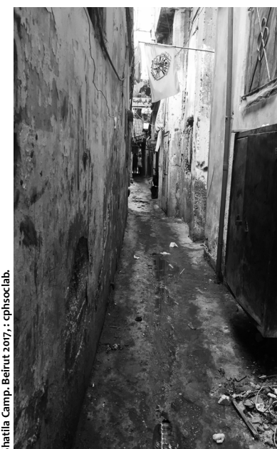
Shatila Camp, Beirut 2017; : cphsociohab.

Inside the camp, we were greeted with surprise and happy smiles in the narrow alleys. We constantly heard “Welcome to Shatila”,