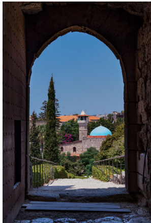
Byblos 2017.

On the 11th August 2017, together with Bent S E Hansen, I embarked on a preparatory fieldtrip to Beirut. Two days later, we received 19 social/case workers, psychologists and pedagogues from across 5 different Danish municipalities as well as the Red