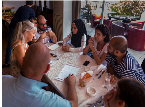
Groupwork, Seidon 2017, photo: cphsoclub.

Dignity is a central value of great importance, and creates a cultural discourse that is crucial in working with young people. It is often men-