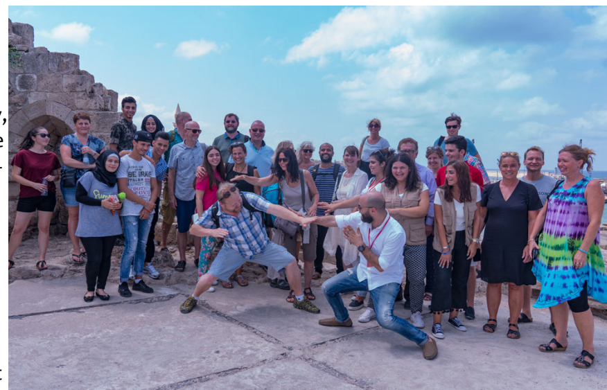
Volunteer youth from DPNA and the danish group, Saidon 2017.

One of the experiences that the participants were faced with in their field work was the energy involved in the initiatives that our partner NGOs presented. The air quivered and was electrified by the commitment, energy and