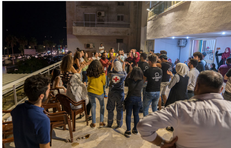
Bussma Youth Center, Saida, 2017.

Beyond what was previously described, one will also tend to think in terms of faster reaction times when it comes to taking action. This is because one doesn’t first have to make an appointment with the psychologist,