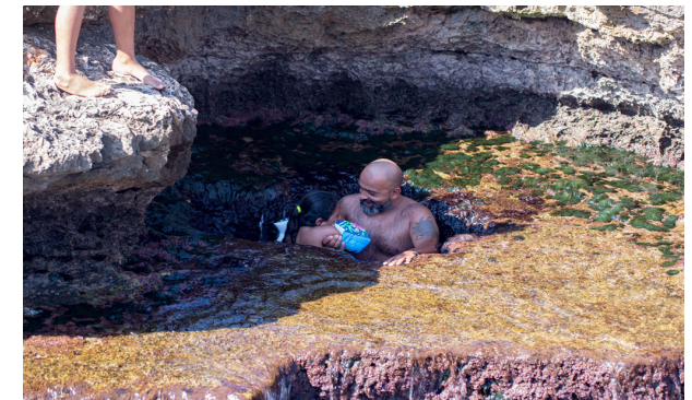
Family life, The Cornitche, Beirut 2017

It is a new approach to get to know their families in a more direct form of contact in order to ensure the best intervention. Contact with the family can, from this perspective, be regarded as a specific way of connecting them to their cultural “compass” (norms and values).