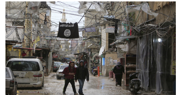
Ain al-Hilweh 2016.

Bussma is also available to kids and young people from the Ain al-Hilweh camp, which is frequently subject to regular battles between warring Palestinian fractions - often with fatal outcomes.