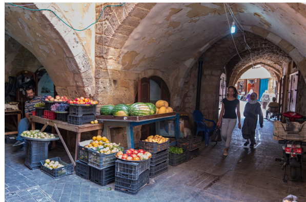
Souk in Saidon 2017

Special thanks to everyone involved for your time, positive energy, and dedication to this project and to the Danish Arab Partnership Programme – Fund for Academic Cooperation and Exchange between Denmark and the Arab world for funding and making this experience possible.