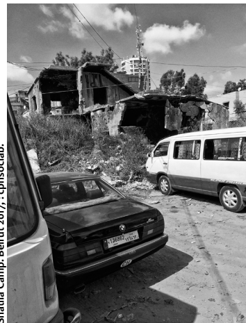
Shatila Camp. Beirut 2017.

The tour ends at the same place as where the group started, and after a solidarity-hug with Ahed, the bus is filled up and a somewhat silent group returns back to base. This will take some time to digest. Ahed's questions of “What will you then say to your government when you get home?” and “Why have you forgotten us?” will remain unanswered in the minds of the participants for the next couple of days.