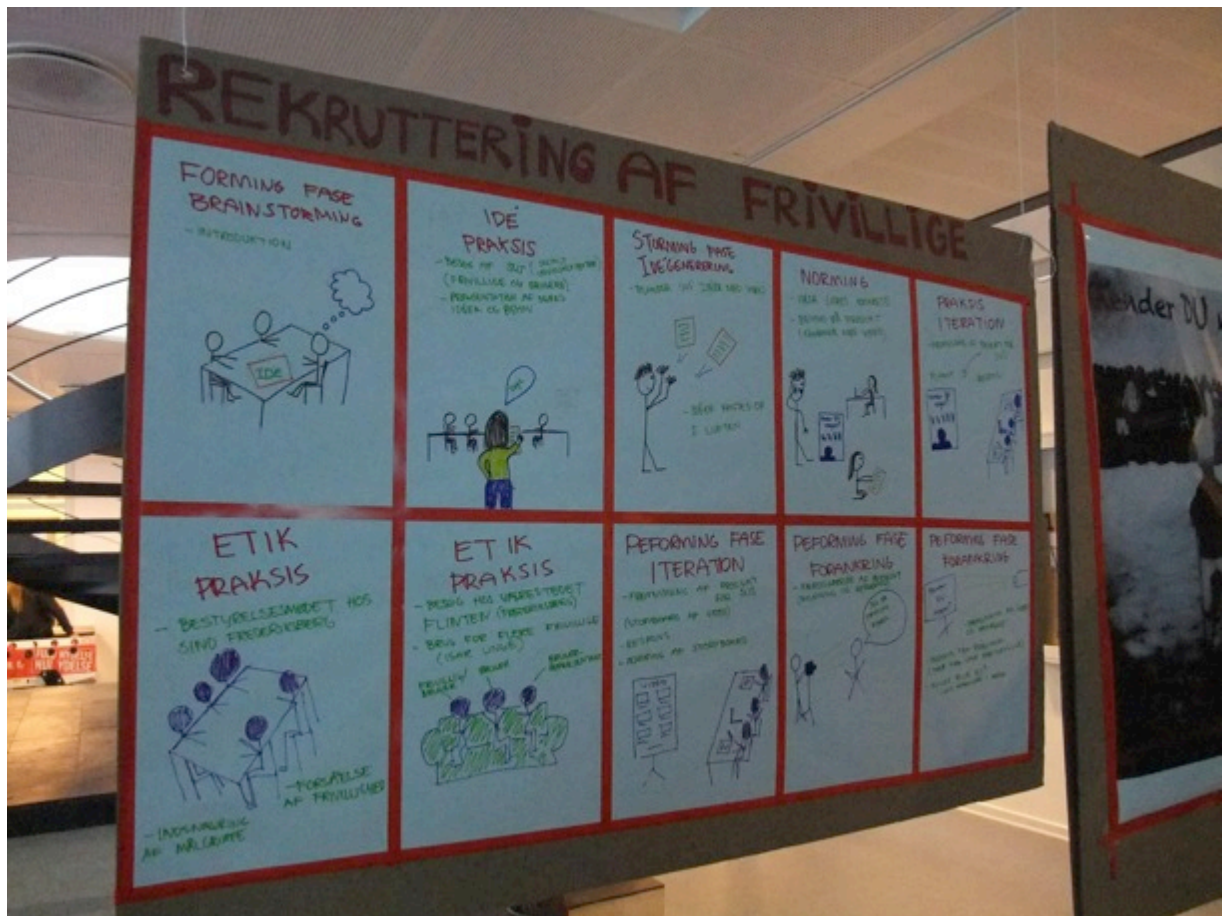
Image 1: Example of one of the design project's storyboards describing the design process involving meeting with different stakeholders and renegotiating the aim and purpose of the design idea. The storyboard is a designer's working tool to visualize the different phases of the design process. In this case it illustrates a recruitment campaign for volunteers and psychologically vulnerable people asking for social support.

that social anxiety would prevent peers from participating in social gatherings despite the fact that they very much would like to. It was also new to them that extreme obsession with one's own physical appearance could result in spending many hours in front of the mirror prior to a social event and even yield the result that someone would decide not to go out at all. It was also new to them that people with depressive periods would not necessarily be able to formulate their need for social contact. These kinds of distributed problems that emerged as a result from co-exploring functionings and capabilities set the scene for the students' potential design ideas. The group then began to draw mind-maps, write post-its, create storyboards (see image 1) etc., illustrating their initial thoughts on how they themselves and people close to them could also be understood as holding a stake in the phenomenon of psychological vulnerability.