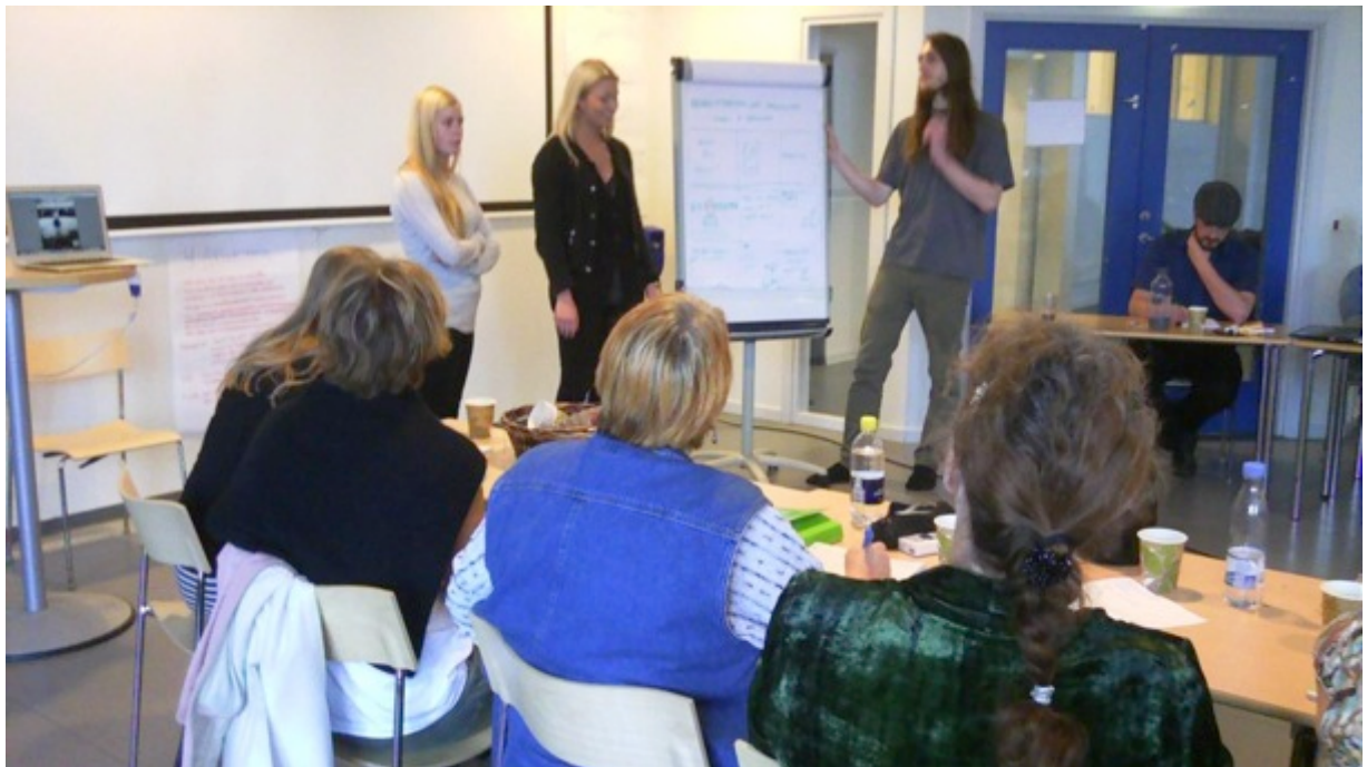
Image 5: students present their first prototypes to the various stakeholders in the project. They get feedback through collective reflection for the next iteration.

We teachers pre-arranged feedback sessions and the student work groups arranged meetings with other NGOs and representatives of volunteer organizations in order to test the initial design ideas and first prototypes. Groups were asked to collectively reflect on the (partly contradictory) feedback they got in relation to their idea, and renegotiate how the feedback would require them to adjust their design idea. Their design objects thus turned into socio-material public entities that were exposed to functional diversity and thereby invited controversies and renegotiations throughout the entire process. This process was also supported by the target stakeholders' explicit feedback and input.