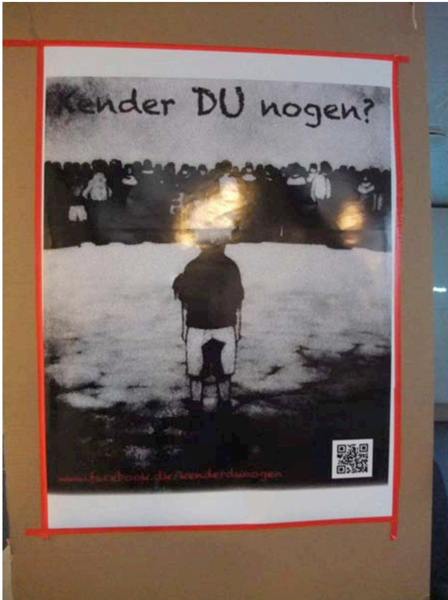
Image 2: Volunteer recruitment campaign logo prototyped by the students.