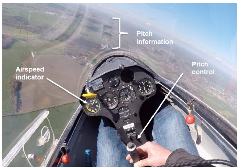
Figure 2. Airspeed information and control in a first-person perspective.

Following Wilson and Golonka (2013), we can ask: What are the resources the pilot has access to in order to solve this task? A glider is equipped with an airspeed indicator (see Figure 2). The airspeed indicator measures the dynamic pressure the airflow exerts on the plane and is thus directly related to the airspeed. The indicator conveys information about the airspeed, and thus, whether it is too low or too high relative to the required airspeed. The problem is that airspeed is a secondary effect of the primary effect of the control, namely, the movement of the elevator. If you use the airspeed indicator to control your airspeed, you will always be lagging behind the change in pitch that has caused the change in airspeed. To control your airspeed you must assess information about the primary effect, that is, the change in pitch that causes a change in airspeed. The pilot must, therefore, pick up information about the pitch.