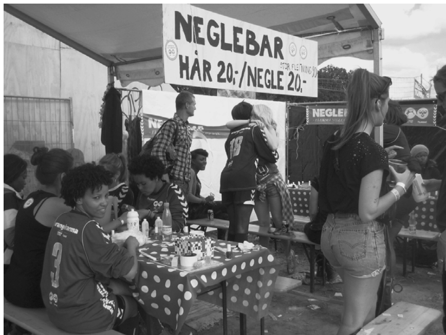
Figure 12.5 Orange Karma booth where festivalgoers and asylum-seekers can meet and talk during a nail or hair treatment

As indicated in the above quote, it is unusual for this kind of event to take place repeatedly at Roskilde Festival, and especially in such a prominent location. Usually