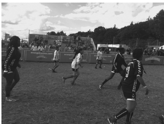
Figure 12.2 Sensational Football tournament at the Roskilde Festival

The main feature in Hummel's Orange Karma area in 2013 at Roskilde Festival was a twin football tournament that took place simultaneously. One tournament comprised teams of asylum-seekers, named after the different asylum centres, wearing matching Hummel gear (see figure 12.3). The other overlapping tournament was made up of ordinary female festival participants who signed up in teams that were more or less created for the event. Some had chosen a silly and festive theme and name for their team, such as 'Puzzy Riders' or 'Girl Power and Fishermen', whereas others had more commercial themes, such as team KitKat – a global candy bar brand – or team Cocio – a Danish chocolate beverage. 30 The teams wore outfits matching the themes (see figure 12.4). The festive front-page picture of Eir Soccer's website appears to be from a similar tournament of festive teams.