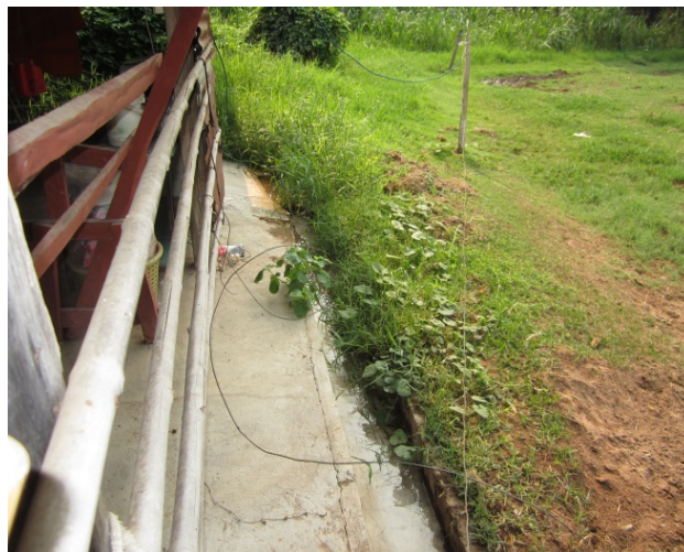
Fig. 3: Manure & cleaning water outlet.

Spill of slurry (liquids) to the surrounding environment in the confinement area, where the cattle's is situated, was observed, leading to possibly surface water and ground water contaminations. Also, spill of liquids (manure, cleaning water) from cleaning and milking the dairy cattle's, was observed. This wastewater is simply distributed in small outlet canals to the grass areas just besides the confinement area. See Figure 3 below.