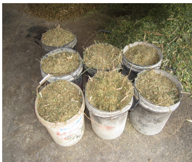
Fig. 5: Napier grass ready as livestock feed.

Napier grass (a sort of fast growing elephant grass) is relatively costly as animal feed compared to rice-straw, cassava-pulp and peel, if not grown on the farmer's own land [14]. Unless the production and harvesting is provided by highly commercial and technological advanced methods, which is slowly being deployed in Thailand [15], it will hardly be viably for biogas production (see Figure 5).