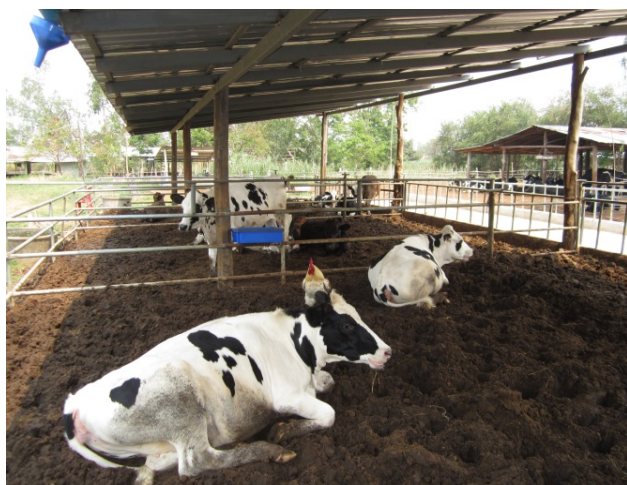
Fig. 1: Soil-flooring stable.

Half of the stables were designed with cement flooring and another half with soil flooring (hence no real flooring). The manure was piling up and the cattle's were walking in a 10-30 cm layer of manure (solid and slurry), as shown in Figure 1. When the manure reaches a certain level it is removed from the confinement area to the grass area just besides and dried in the sun, illustrated in Figure 2. All farmers sell dried manure to other local farmers in 15 kg bags at a cost of approximately 30 bath per bag (2,000 bath/tons). (Farm #1) As an example the total income from sale of 2.500 bags of manure added up to 75.450 bath on an annually basis.