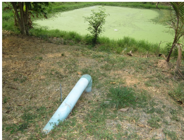
Fig. 4: Wastewater from the dairy in Tambon Ban Kor.

The data below is from interviews in Bangkok, from field trips to Pakchong and Tambon Ban Kor, where a napier grass expert and the dairy cattle farmers were visited respectively.