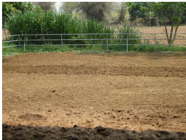
Fig. 2: Manure drying in sun.