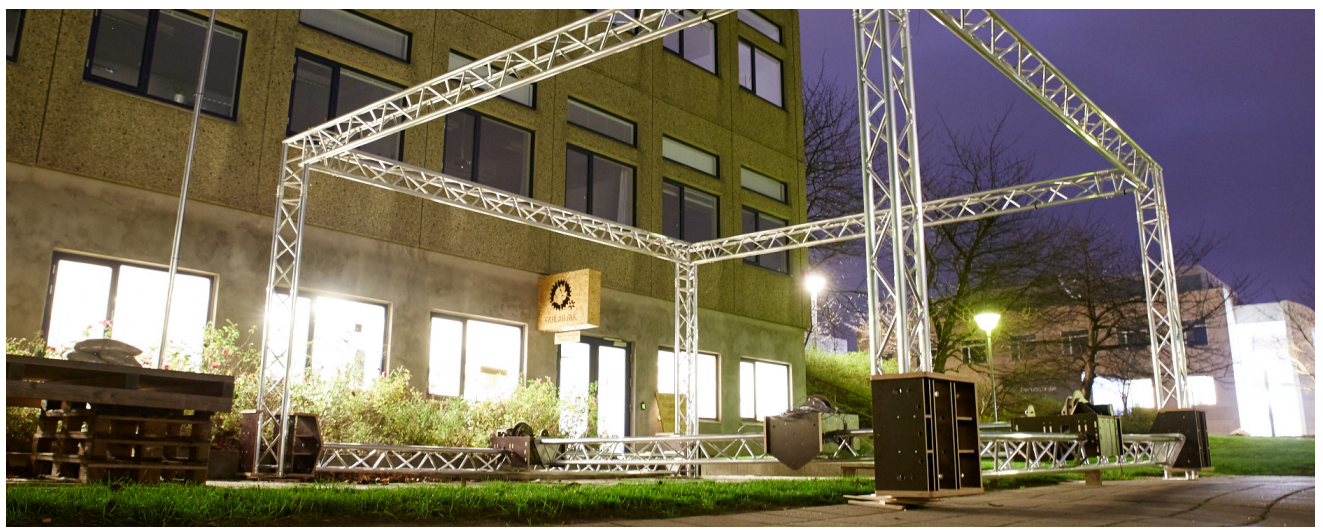
Figure 6: The giant 3D printer by Fablab RUC