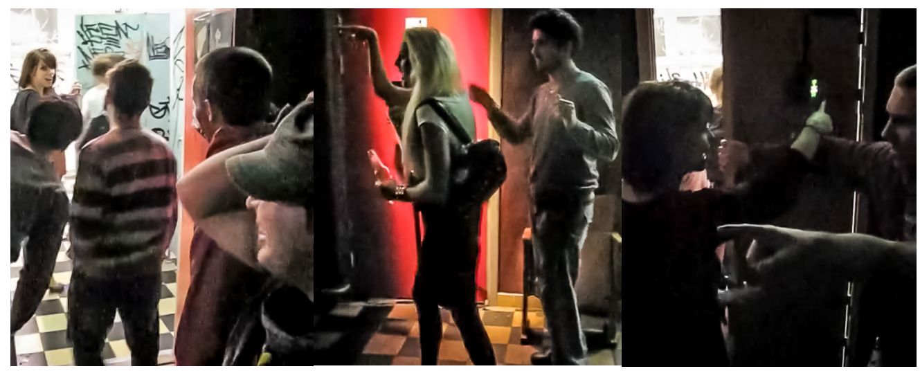
Figure 2: Stills from video documentation of Ladies' and Men's Room mixup