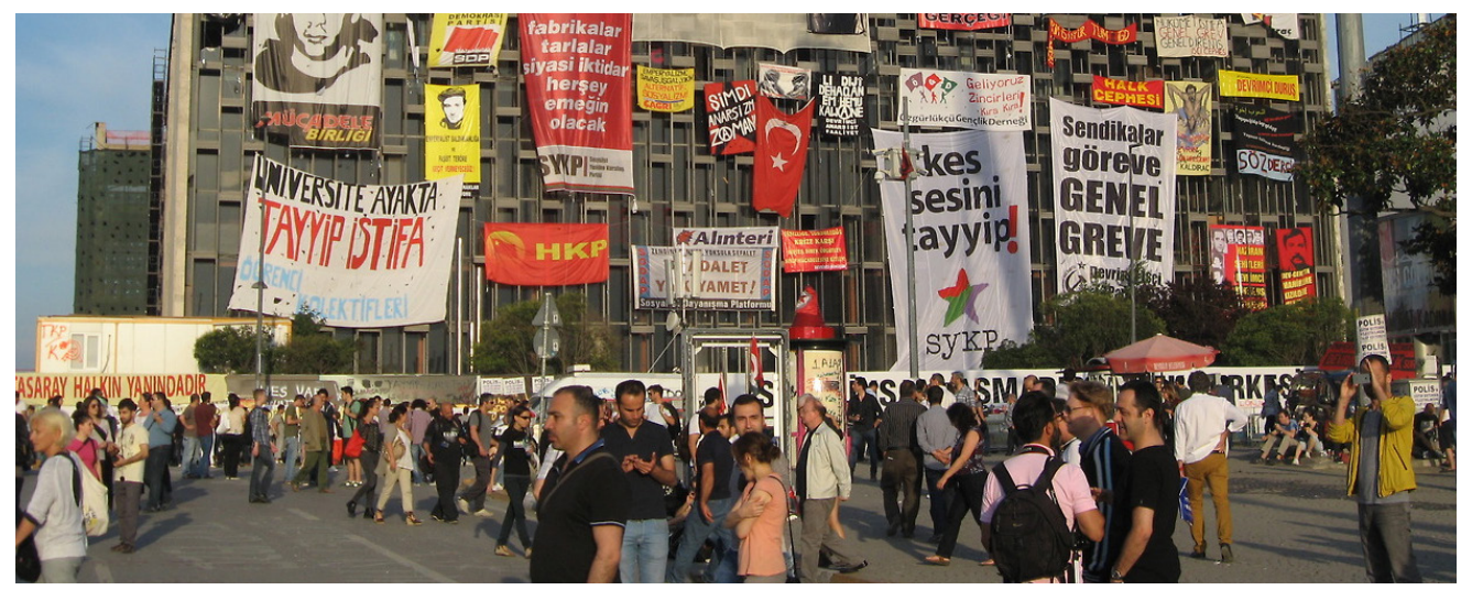
Figure 5: Occupy Gezi