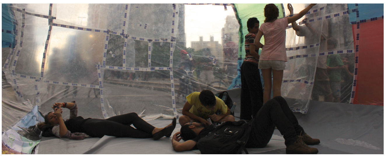
Figure 3: Muda Colletivo's inflatable bubble