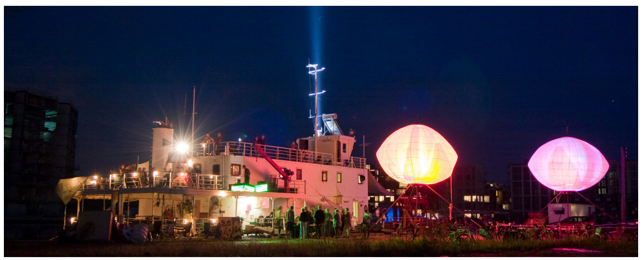
Figure 4: illutron collaborative interactive art studio