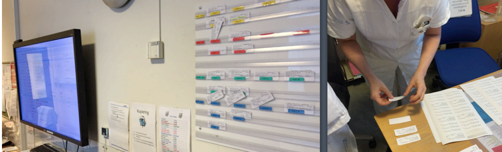
Figure 2. eWB (left), manual board (middle), arranging printed labels for the manual board (right).

being ready for transfer to the operating room (OR). It is, however, complicated to establish new eWB-mediated ways of interdepartmental coordination. The hospital departments are traditionally quite autonomous, each having their own culture and procedures, and there is little incentive to use the eWB in a manner that would benefit other departments (Lassen and Simonsen, 2014).