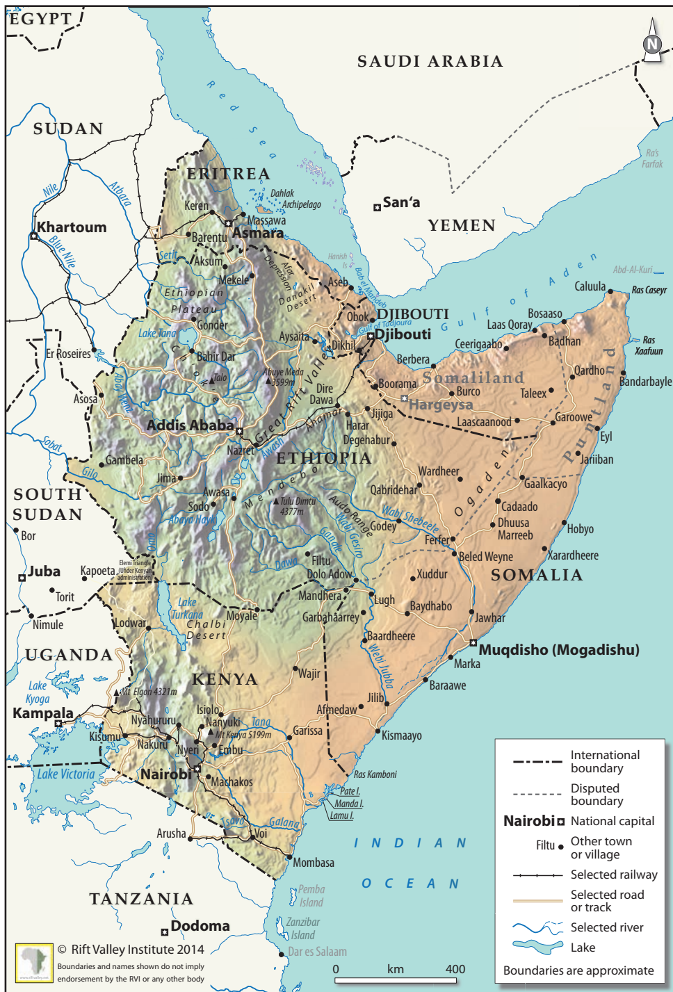
Map 1. The Horn of Africa