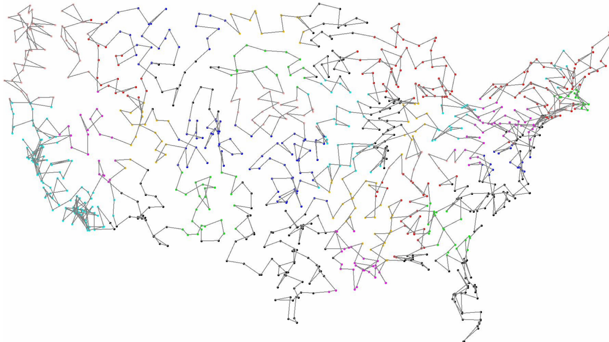
Figure 1 Optimal BTSP tour for usa1097.

Figure 1 shows the optimal BTSP tour for usa1097, an instance consisting of 1097 cities in the adjoining 48 U.S. states, plus the District of Columbia. Its total length is 127,786,915 meters, and its bottleneck edge has a length of 175,360 meters. In comparison, the optimal TSP tour for this instance has a total length of 71,109,602 meters and a bottleneck edge length of 195,002 meters.