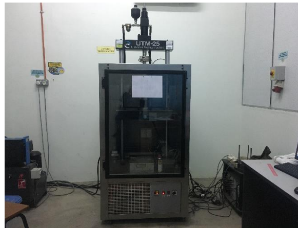
Figure 2. Universal Testing Machine