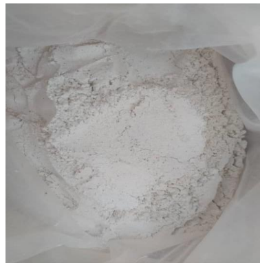
Figure 1. Eggshell Powder