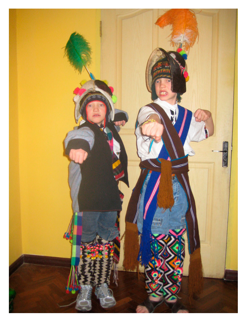
Figure 1. The boys dressed in tinku fighting regalia.

hilarious anti-piracy music video 30,000 Chanchos ('30,000 Pigs'), which features a song style connected with the Macha tinku.<sup>8</sup>