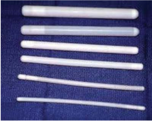
Figure-4: Showing silicone stents of different sizes.

silicone stents of different size. The stent removal time, on average, is 2 weeks. Removal of the stent is carried out in the operating room. 1