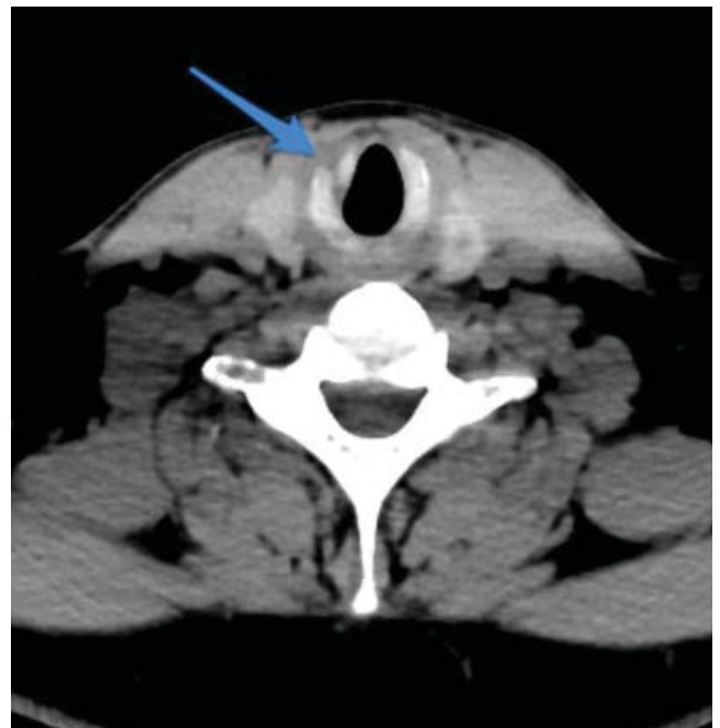
Figure-1: Arrow showing Fracture of right anterior half of cricoids.

CT scan can help to identify the underlying laryngeal and pharyngeal injuries including fractures, dislocations and other associated injuries. Oesophagus is the most commonly involved adjacent organ in laryngotracheal trauma. CT scan helps in differentiating between the patients who would require surgical interventions to those who can be managed conservatively (Figure-1 & 2). 7,8 CT scan may not be indicated in case of open wound with obvious fracture where surgical exploration and repair is ultimate choice of treatment. CT angiogram can also be considered in case of suspected vascular injury.