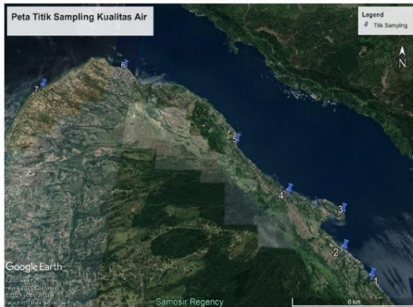
Figure 2. Map of water sampling location

lake (Walukow, 2010). Different results were obtained in the results of the STORET analysis in the Riam Kanan dam which produced class B lightly polluted, namely water that can be used for freshwater fish farming, water farming to irrigate plants and / or other uses that require the same water quality as this use (Rahayu, A., Rahman, A., & Dharmadji, 2017).