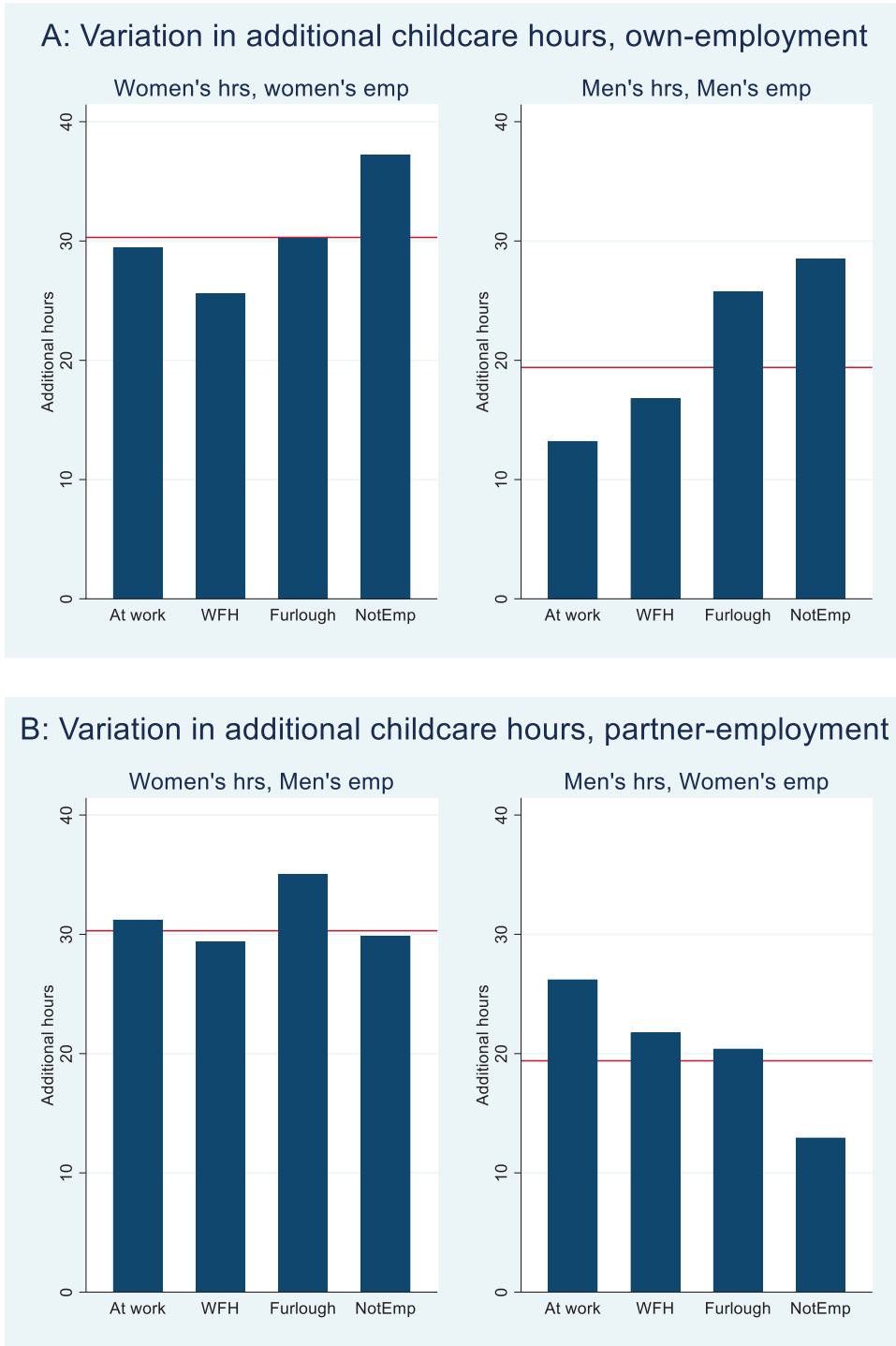
Figure 1: Additional hours' childcare (total per week), by post-COVID-19 employment status

Notes: The figure shows average self-reported total hours additional childcare done by men and women post-COVID-19. For further information on questions asked, see section II.