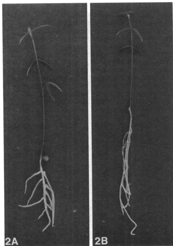
FIG. 2. V. sativa subsp. nigra inoculated with Sym plasmid pRL1JI-harboring strain RBL5601 (A) or Sym plasmid-devoid strain RBL5505 (B). The Tsr phenotype is only observed in Fig. 2A. The phenotype of uninoculated plants (not shown) is similar to that shown in Fig. 2B. The plants were cultured on solid medium as described in Materials and Methods and photographed on day 14.

Root hair phenotypes. To check for possible root hair