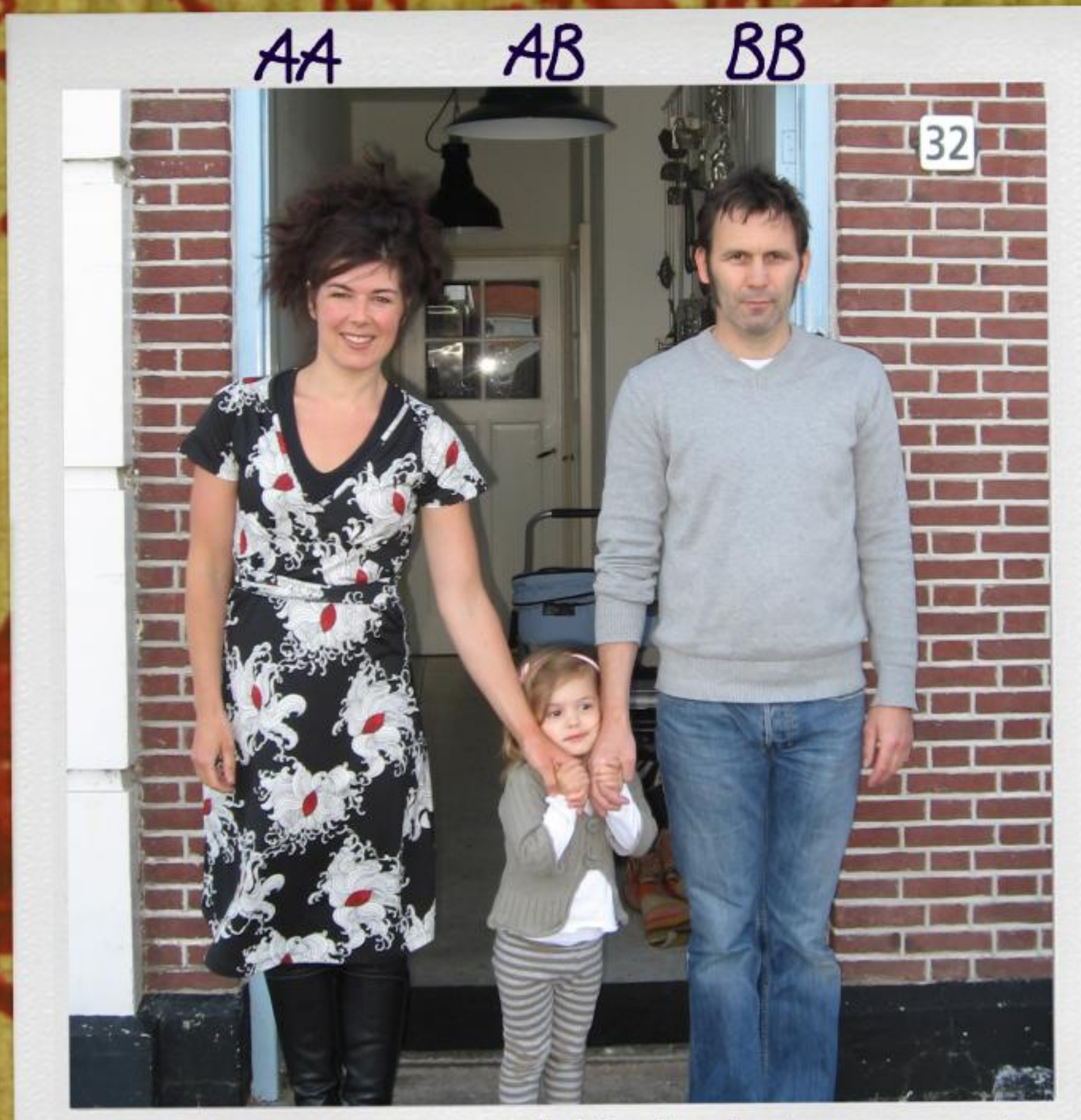
Two homozygotes and their heterozygote offspring, with noticeably allround inferior performance: in size, in cooking, driving & language skills, etc.