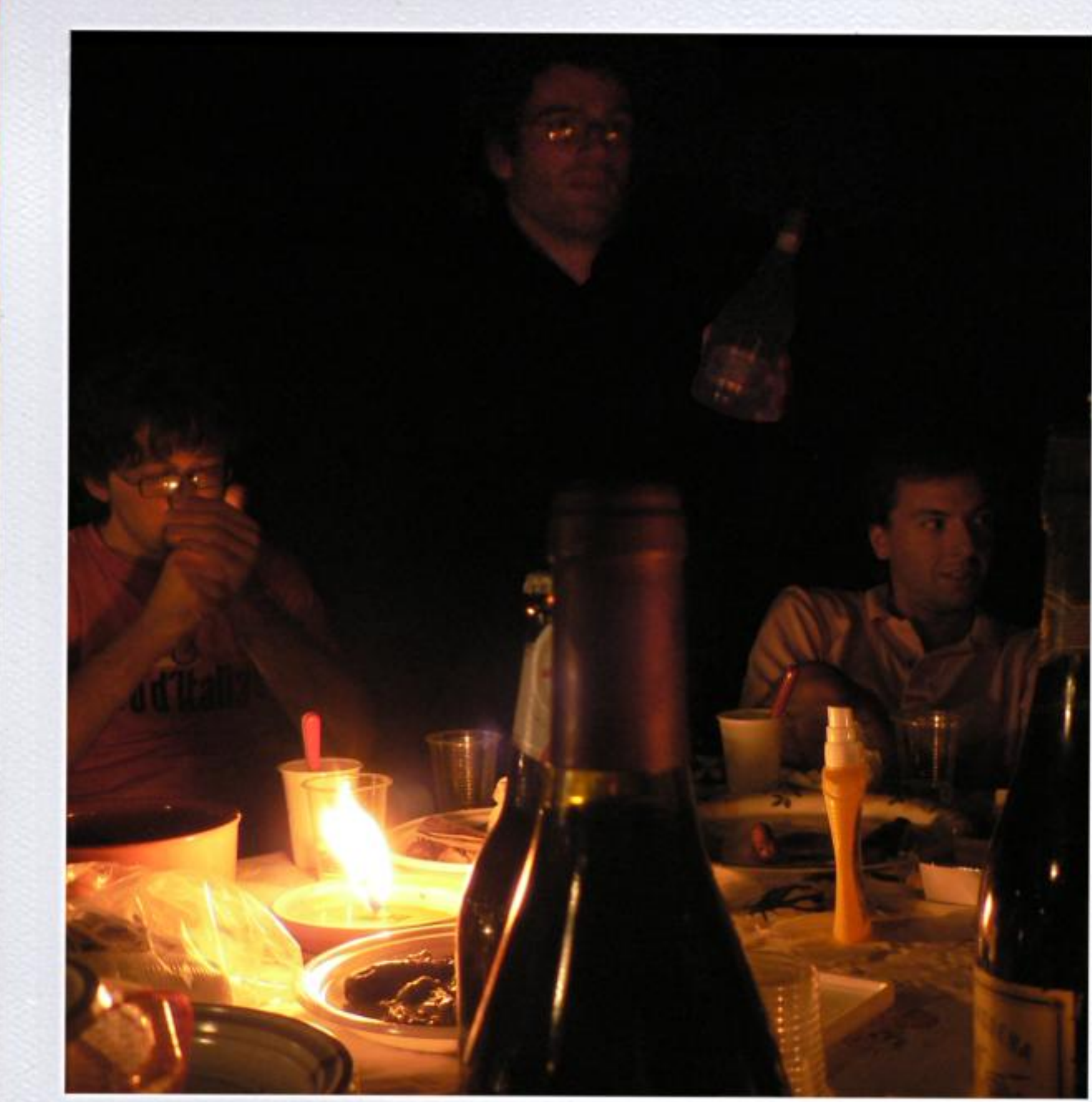
Apparently it is only from the third order onwards that things start to diverge, and versions start to differ.