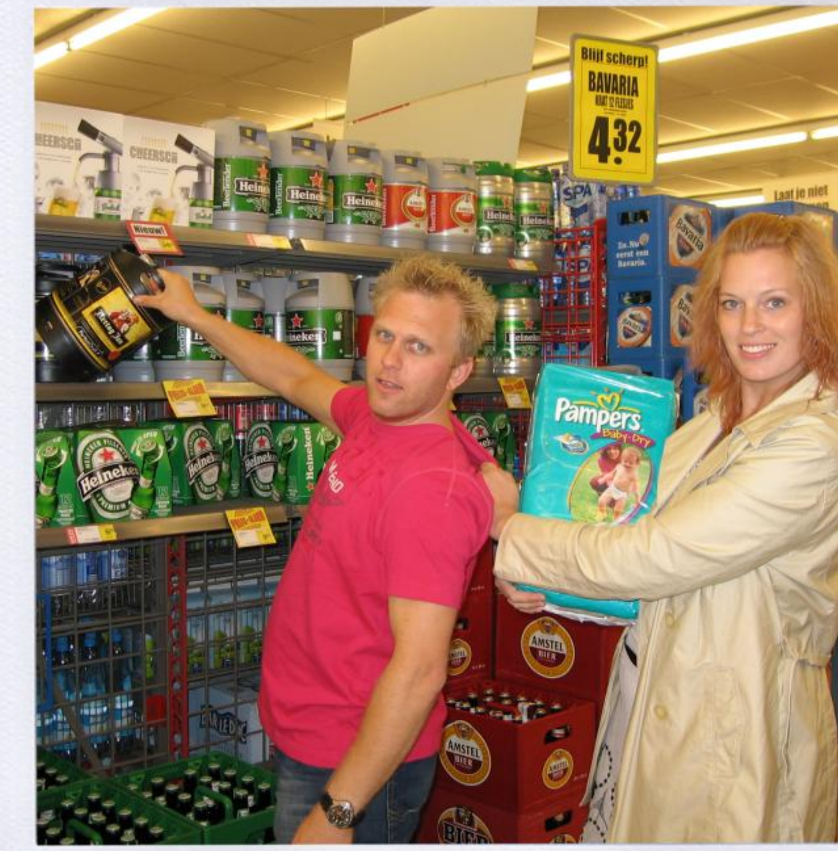
Sexual dimorphism: males and females evolve to forage for different resources.