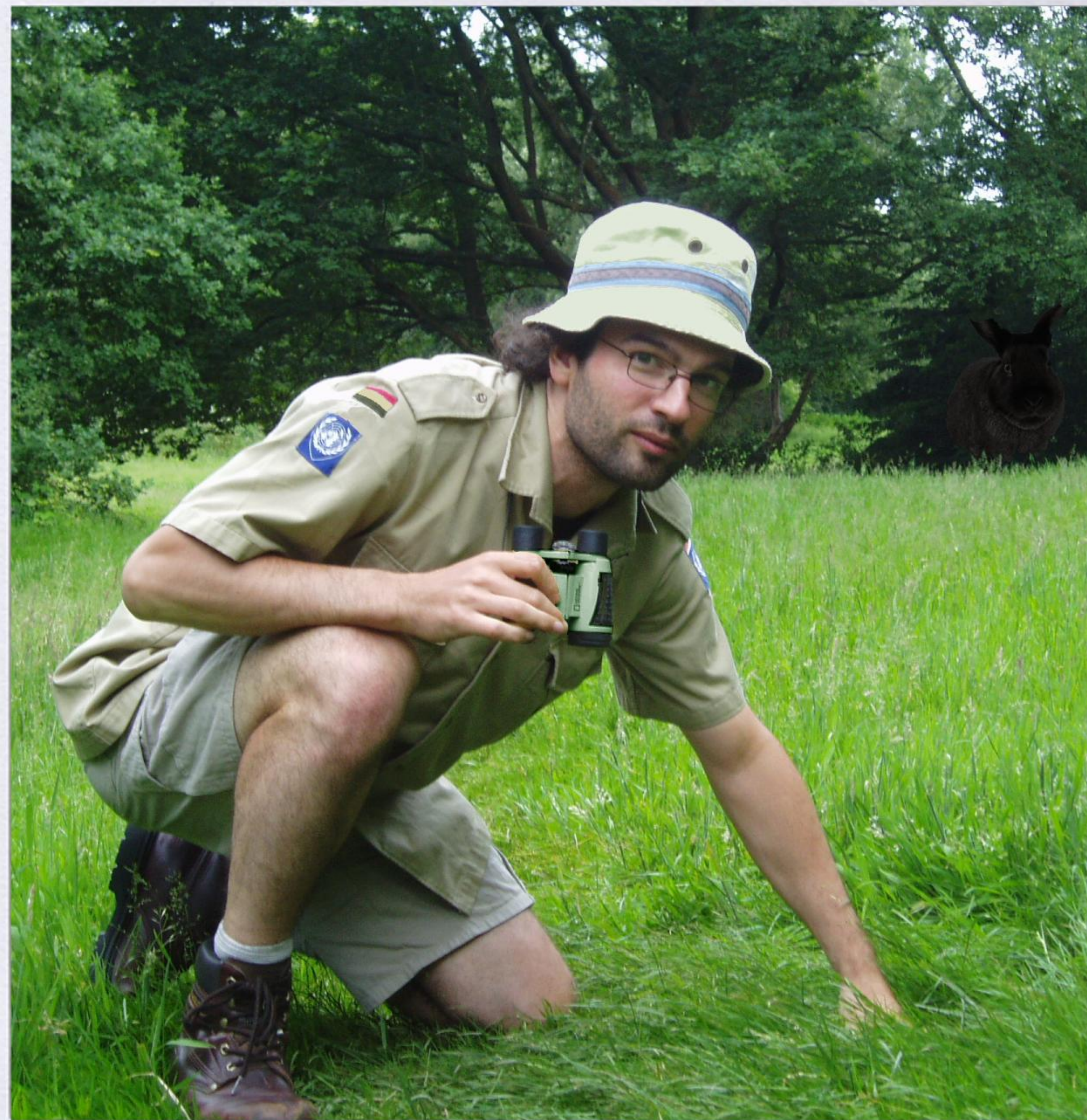
Your guide to local expansions.