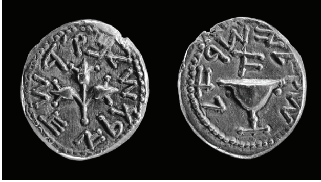
Fig. 3: A shekel from the first year of the revolt (66 AD). Inscribed on the coin is 'Shekel of Israel', 'one' (observe) and 'Jerusalem the Holy' (reverse).

different agenda. Before the end of 66 AD they minted the first coinage of the new state: high quality silver coinage. 52