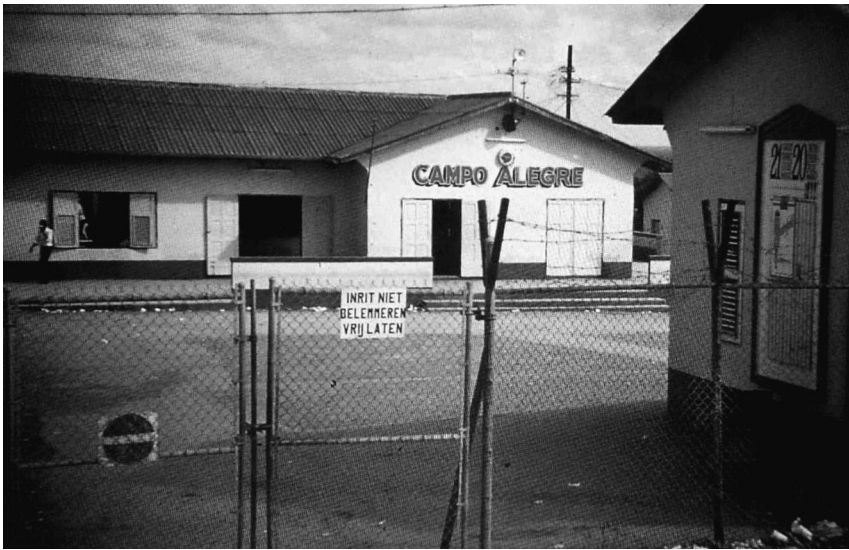
ILLUSTRATION 1 Campo Alegre on Curaçao, 1963

The entrance of Campo Alegre. Photographed on the occasion of the clearance of North American personnel from the camp during the visit of a American destroyer to Curaçao in 1963.