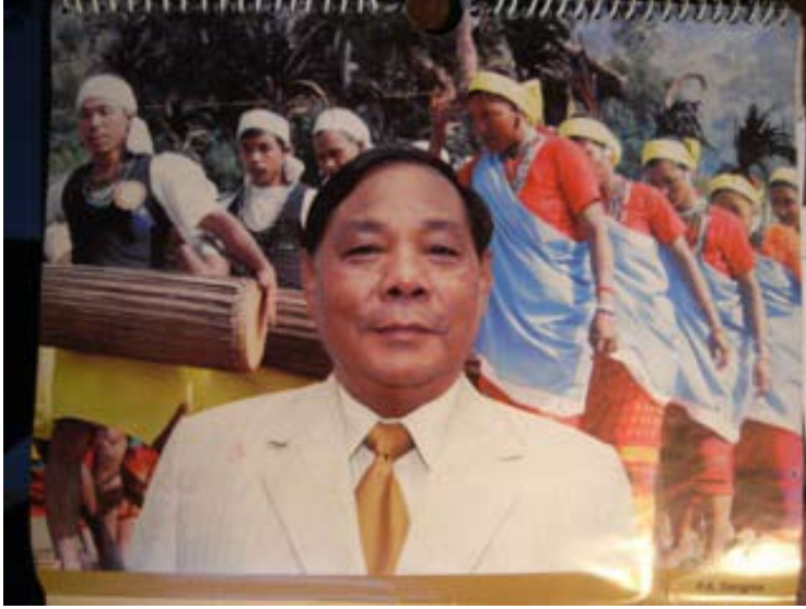
FIGURE 2: Meghalaya politician Purno Sangma, with a picture of a Wangala dancing troupe as a backdrop (detail from a calendar distributed during an election campaign in 2009).

It seems unlikely that Wangala previously enjoyed great prominence among Garo subgroups other than the Ambeng, if it was celebrated among other groups at all. But over the last couple of decades, Wangala has become a core element of what has emerged as a shared Garo culture.