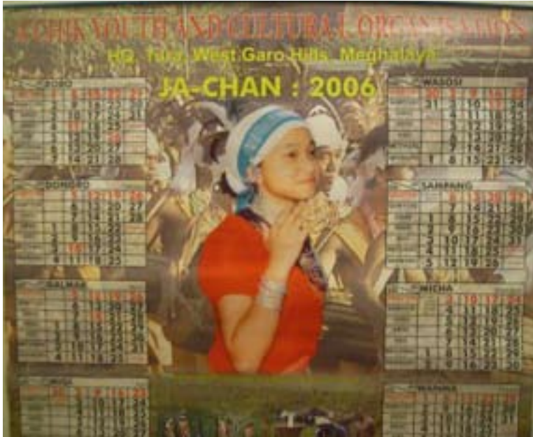
FIGURE 1. Detail from a 2006 calendar, distributed by the “Garo Youth and Cultural Organization.” The calendar shows a photo montage of a Christian Garo college student against a backdrop of Songsarek dancers (A’chik Youth and Cultural Organization, 2006).

Presently, Songsareks make up only a small portion of the Garo population. Christianity has been essential to primary education in Meghalaya, and over the past couple of decades the vast majority of the Garo have become Christians. Songsareks, or “the ones who obey the deities” ( mitde manigipa ) as they refer to themselves, only remain in a few rural pockets.