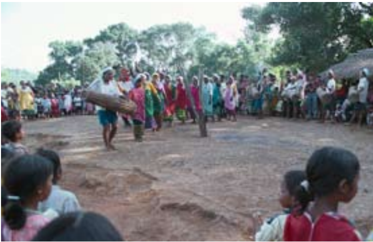
FIGURE 4. Wangala dancing in a Garo village. Photograph by the author, 15 October 2000.

In the few villages where Songsareks still celebrate Wangala, Christian families obviously do not participate. In villages that converted to Christianity a long time ago, and in towns where the Songsarek practices are at best a memory of a past way of life, village-style Wangala celebrations are altogether absent. There, the