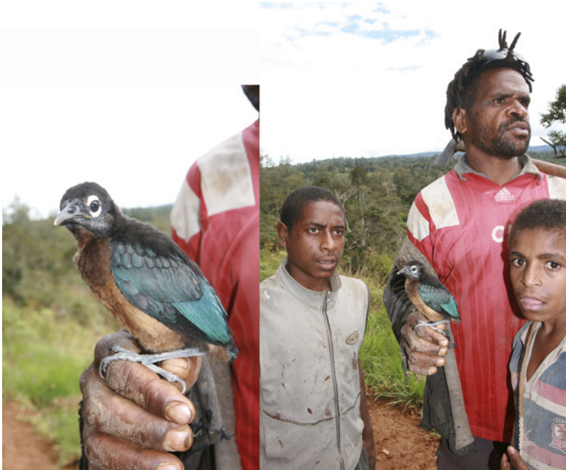
Figure 2. A young BBOP collected from the nest for consumption (Pi clan, Southern Highlands Province, PNG, June 2008; Michiel O. L. van den Bergh).

Next to the trade between inhabitants themselves, on average about a third of the skins are sold to tourists. This sale mainly takes place at the Tari market, at a tourist lodge, at Mount Hagen's airport, and at the cultural showground and hotels in Mount Hagen. BBOP seem to be more regularly traded in the Enga research area than in the Tari research area; between, depending per community, one and nine each year per research community in the Tari research area, while in the Enga research area between one and 20.