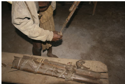
Figure 4. An inhabitant showing how he keeps his feathers secure in tubes to prevent the feathers from wearing out (Munima clan, Southern Highlands Province, PNG, June, 2008;).

More research should be conducted on the collection and trade of the BBOP in more areas and for longer periods of time, so that nationwide trends can be fully understood. Also, research is needed to better understand the effects of deforestation. BBOP observations and interviews during this research suggest that the bird's reported poor tolerance of habitat degradation (BirdLife International 2000, Bird in litt. ) may be over-estimated (certainly with regards to foraging), which warrants a further investigation to verify or invalidate this statement. Lastly, more research is needed on the bird's population (distribution, density, size and trends) and reproduction rate. This combined research would help to better understand the ecological sustainability of collection and to determine hunting thresholds in particular areas.