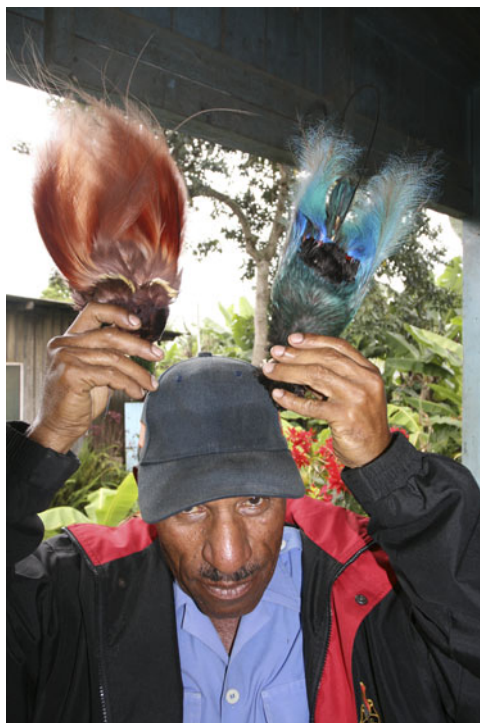
Figure 3. A Mount Hagen policeman showing a Ragianna and Blue Bird-of-paradise skin which he had bought for no particular reason. Does that mean that it was bought for customary purpose or does it mean that it was bought illegally? Either way, the policeman did not seem to care about the (B)BOP trade restrictions at all (Mount Hagen, Southern Highlands Province, PNG, June 2008;).

were proud these birds occurred in their area as they are unique to PNG and because BOP are PNG's national symbol. As a response to these conservation incentives, several interviewees indicated that they tell their children they should not to hunt too many BBOP and should not cut trees unnecessarily, while they claim to act accordingly themselves.