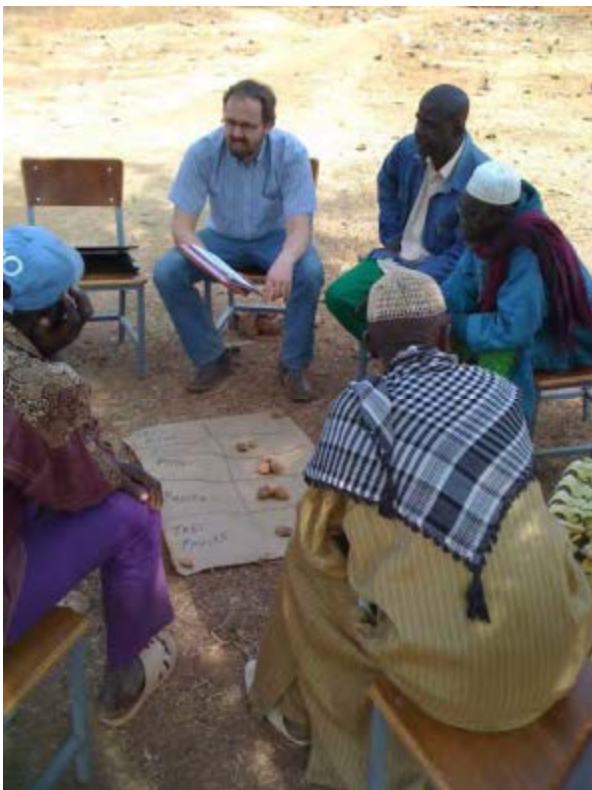
Photo 1: Focus group with elderly men in Tô, March 2012