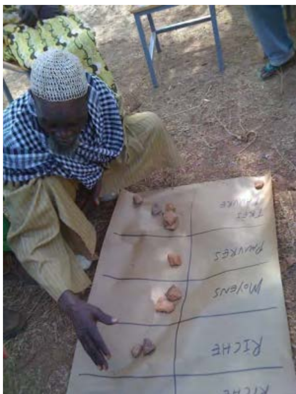
Photo 2: Impact on wealth categories exercise using stones, Tô, Burkina Faso, March 2012

In all three communities, we found that many of the best interventions start out with benefits for the very poor and poor at the time of their inception. This is also in line with the stated aims of most development interventions. However, these benefits tend to decrease considerably over time. Vice versa the rich and very rich are reported to experience increased benefits over time in most of the selected best interventions. The reasons provided for this were that the rich and very rich have the means and assets to take advantage of an intervention. For example, if a road is constructed, the rich and very rich benefit more because they have transportation means and business activities and are in a position to travel more often. Benefit biases and elite capture by people with more resources and higher social status is not an uncommon phenomenon, and has been reported in the development literature before.