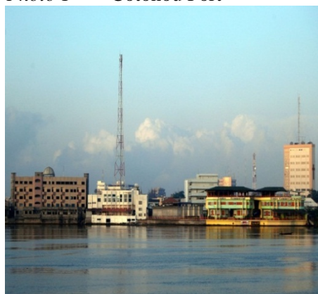
Photo 1 Cotonou Port

The République du Bénin , is a country in West Africa. It is bordered by Togo to the west, by Nigeria to the east and by Burkina Faso and Niger to the north. A majority of the population (total: 9.1 million inhabitants in 2011) lives on its small southern coastline on the Bight of Benin. The capital of Benin is Porto-Novo, but the seat of government is in Cotonou, the country's largest city and located between the Ocean and lake Nokoué, and also the country's major port city. Also the city of Ouidah is a coastal town. All coastal towns are vulnerable to the combined effects of sea level rise, increasing river discharges during the rainy season and oceanic storms, occasionally causing floods (e.g. in 2010) and damage to infrastructure.