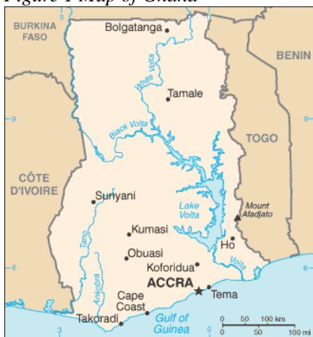
Figure 1 Map of Ghana