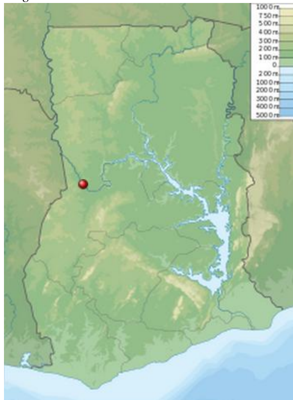
Figure 6 Location of the Bui Dam

http://en.wikipedia.org/wiki/File:Ghana_physical_map.svg