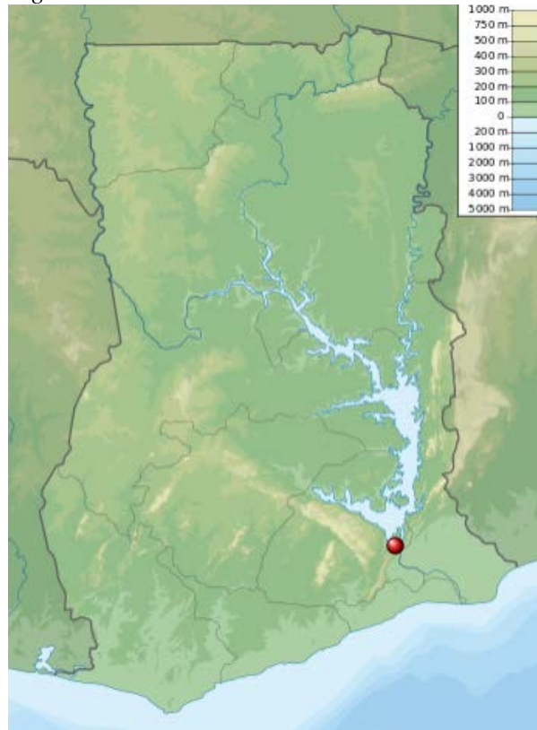
Figure 5 Location of the Akosombo Dam

http://en.wikipedia.org/wiki/Akosombo_Dam#mediaviewer/File:Ghana_physical_map.svg