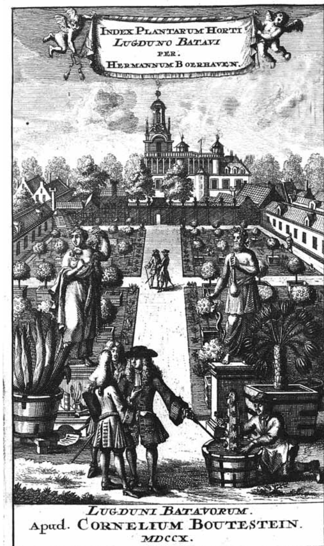
Fig. 5 Hortus Academicus Lugduno-Batavus as depicted in Boerhaave (1710).

Note — The short plant up to 1 cm tall, the suborbicular leaf with purple spots on the abaxial surface, the flexuous, successive racemose inflorescence with a single flower open at a time, the conspicuous thickening of the apex of the dorsal sepal, and the ligulate, unlobed, mostly inornate lip, which is shallowly depressed longitudinally in the middle places Specklinia lugduno-batavae in the S. digitalis species group (Fig. 3). The few tiny flowers and short inflorescence are similar to that of S. pisinna (Fig. 4), a species known to occur in Mexico, Guatemala and Honduras. However, the new species can be distinguished by the prostrate habit (vs erect habit), with shorter leaves, up to 8 mm long (vs 11 mm), the flexuous inflorescence containing up to 6 flowers (vs straight, containing up to 3 flowers), the creamy-white flowers (vs heavily suffused and striped with purple) and the shorter lip (up to 1.6 vs 2.3 mm). From the Mexican endemic S. digitalis , it can be distinguished by the smaller prostrate habit with shorter leaves, 4–8 mm long (vs 12–15 mm) and shorter inflorescence (up to 2 vs 15 cm long) the ligulate to narrowly elliptic petals (vs obovate). Specklinia succulenta from French Guyana is also similar, but the new species can be distinguished by the prostrate habit (vs erect), the short inflorescence (up to 2 vs 10 cm long), the whitish cream flowers (vs greenish yellow) and the immaculate lip (vs a lip with two purple stripes).