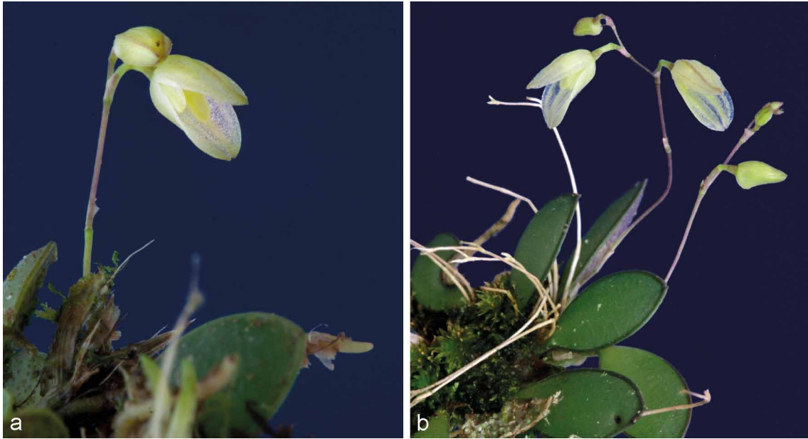
Fig. 2 Specklinia lugduno-batavae Karremans, Bogarín & Gravend. a. Close-up on a flower; b. showing the habit (a. Pupulin 7709; b. Bogarín 6761, both JBL-spirit)