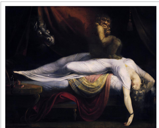
FIGURE 1 | The Nightmare: oil painting by Henry Fuseli (1781).

The present methodology adhered to the guidelines for the preferred reporting items for systematic reviews and meta-analyses (12). Search procedures, study selection, quality assessment, and data extraction were performed independently by at least two of the authors. Discrepancies were resolved during consensus meetings.