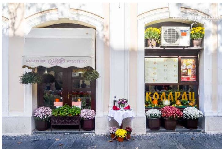
Photo No. 6. Restaurant Kolarac