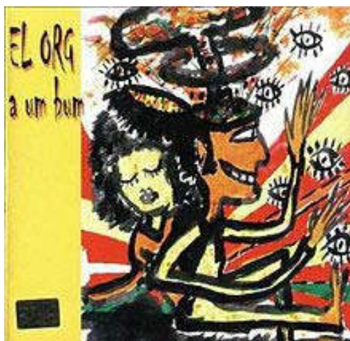
Photo No. 5. Front cover of A Um Bum

While strolling through the urban neighborhood of Skadarlija , I listen on my mobile phone to an old album of the Belgrade-based rock band Električni Orgazam: A Um Bum was released in 1999. The harmonically simple but powerful tune of “Nemoć, bes i očaj” (powerlessness, anger, and despair), at slightly over eight minutes by far the longest track on this album, bashes my ears and interacts strangely with the soundscape of Belgrade’s bohemian quarter, today consisting mainly of shoes touching the cobblestones, clattering of cutlery, laughter and conversations arising from the guests of the many restaurants, and, in the distance, the faint sounds of a traditional brass band.