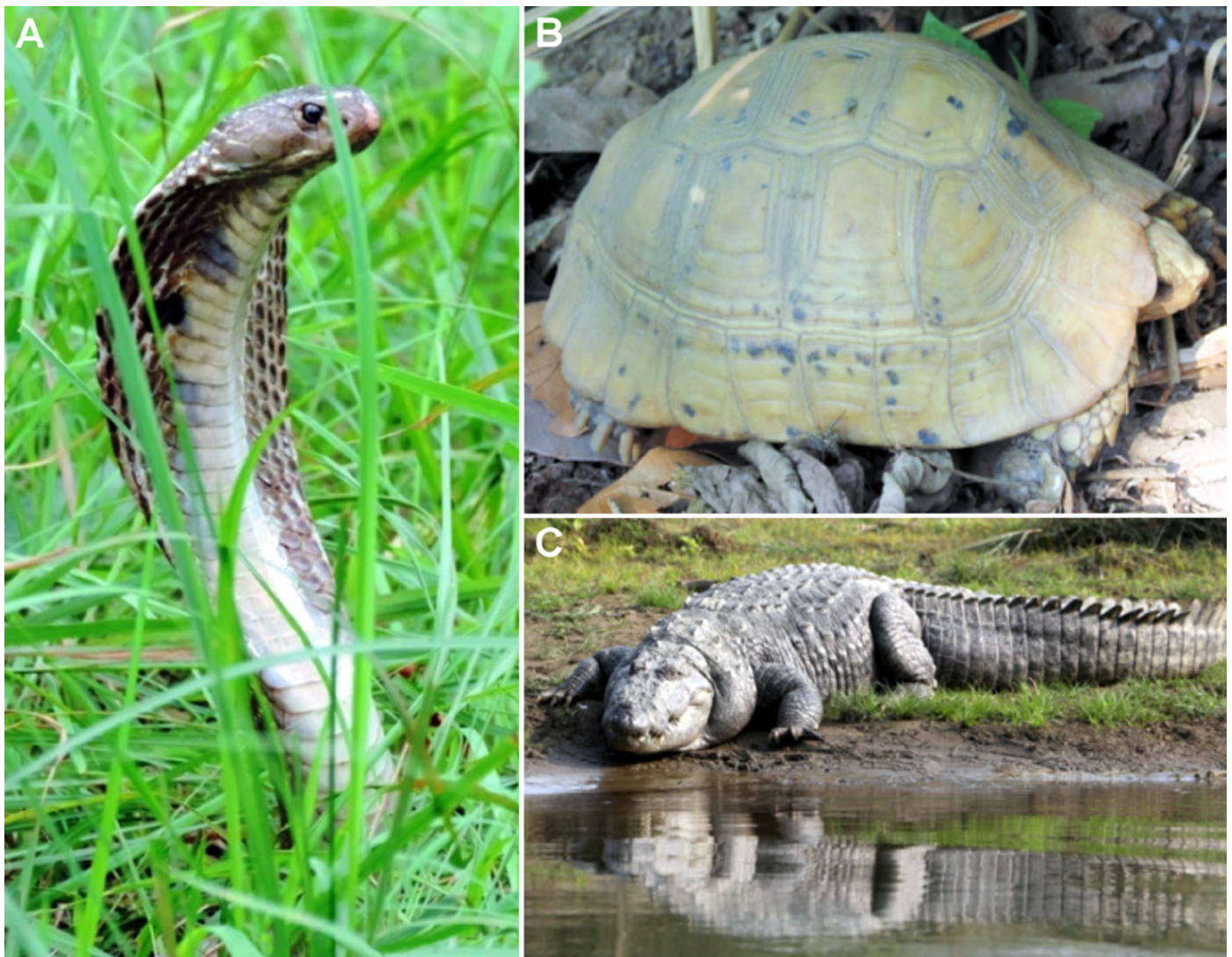
Fig. 9. Additional reptiles recorded during surveys at Beeshazar and associated lakes: (A) Indian Cobra ( Naja naja ); (B) Elongated Tortoise ( Indotestudo elongata ); (C) Mugger Crocodile ( Crocodylus palustris ).