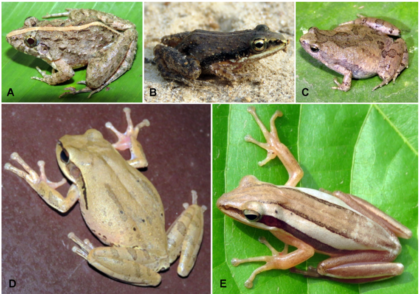
Fig. 3. Additional anurans recorded during surveys at Beeshazar and associated lakes: (A) Terai Cricket Frog ( Fejervarya teraiensis ); (B) Terrestrial Frog ( Fejervarya sp.); (C) Ornate Narrow-mouthed Frog ( Microhyla ornata ); (D) Indian Treefrog ( Polypedates maculatus ); (E) Terai Treefrog ( P. taeniatus ).

( Crocodylus palustris ) are listed as Vulnerable (VU) and the Elongated Tortoise ( Indotestudo elongata ) as Endangered (EN) in the IUCN Red List (IUCN 2016). Python bivittatus and the Yellow Monitor ( Varanus flavescens ) are legally protected reptiles and are accorded the highest degree of protection under the 1973 National Parks and Wildlife Conservation Act of Nepal.