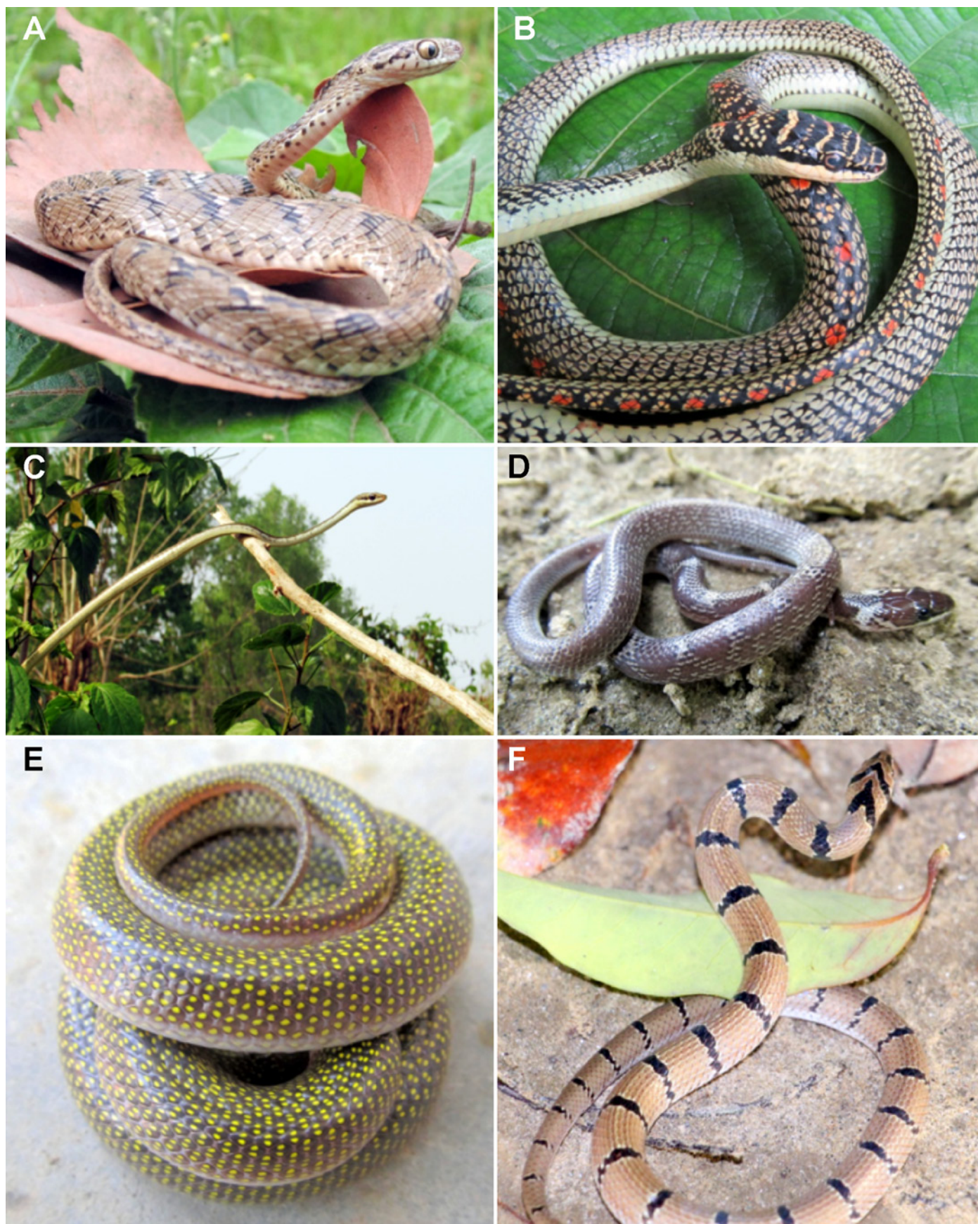
Fig. 7. Additional snakes recorded during surveys at Beeshazar and associated lakes: (A) Common Catsnake ( Boiga trigonata ); (B) Golden Flying Snake ( Chrysopelea ornata ); (C) Common Bronze-backed Treesnake ( Dendrelaphis tristis ); (D) Indian Wolfsnake ( Lycodon aulicus ); (E) Twin-spotted Wolfsnake ( L. jara ); (F) Common Kukri Snake ( Oligodon arnensis ).