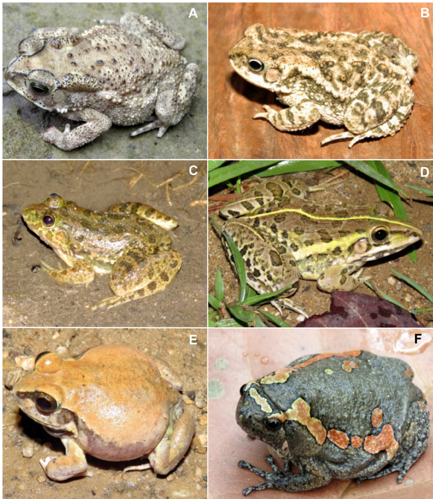
Fig. 2. Anurans recorded during surveys at Beeshazar and associated lakes: (A) Common Asian Toad ( Duttaphrynus melanostictus ); (B) Marbled Toad ( D. stomaticus ); (C) Skittering Frog ( Euphlyctis cyanophlyctis ); (D) Indian Bullfrog ( Hoplobatrachus tigerinus ); (E) Indian Burrowing Frog ( Sphaerotheca breviceps ); (F) Indian Painted Frog ( Uperodon taprobanicus ).

Thirty of the 47 species recorded (64%) have not been assessed using IUCN Red List criteria (IUCN 2012). The Burmese Python ( Python bivittatus ) and Mugger Crocodile