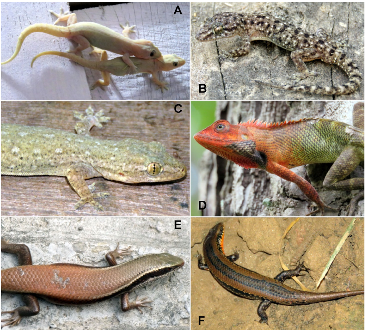
Fig. 4. Lizards recorded during surveys at Beeshazar and associated lakes: (A) Yellow-bellied House Gecko ( Hemidactylus flaviviridis ); (B) Brook's House Gecko ( H. brooki ); (C) Common House Gecko ( H. frenatus ); (D) Oriental Garden Lizard ( Calotes versicolor complex); (E) Common Indian Skink ( Eutropis carinata ); (F) Bronze Skink ( E. macularia ).