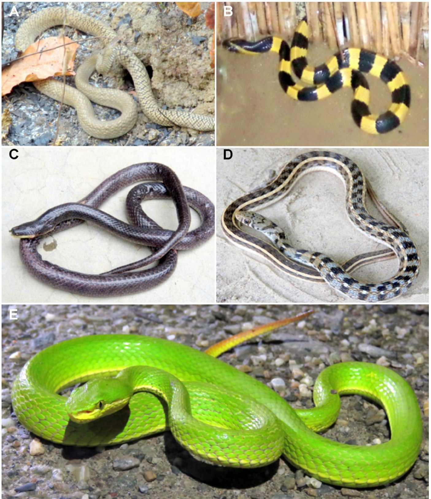
Fig. 8. Additional snakes recorded during surveys at Beeshazar and associated lakes: (A) Oriental Ratsnake ( Ptyas mucosa ); (B) Banded Krait ( Bungarus fasciatus ); (C) Lesser Black Krait ( B. lividus ); (D) Buff-striped Keelback ( Amphiesma stolatum ); (E) Nepal Pitviper ( Trimeresurus septentrionalis ).

Conservation of the Amphibians, Reptiles, and Their Habitats in South Asia . Amphibia and Reptile Research Organization of Sri Lanka (ARROS), Peradenia, Sri Lanka.