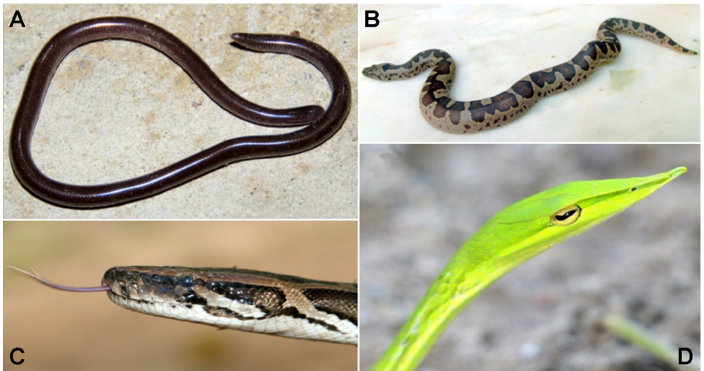
Fig. 6. Snakes recorded during surveys at Beeshazar and associated lakes: (A) Braminy Blinksnake ( Indotyphlops braminus ); (B) Common Sandboa ( Eryx conicus ); (C) Burmese Python ( Python bivittatus ); (D) Long-nosed Treesnake ( Ahaetulla nasuta ).