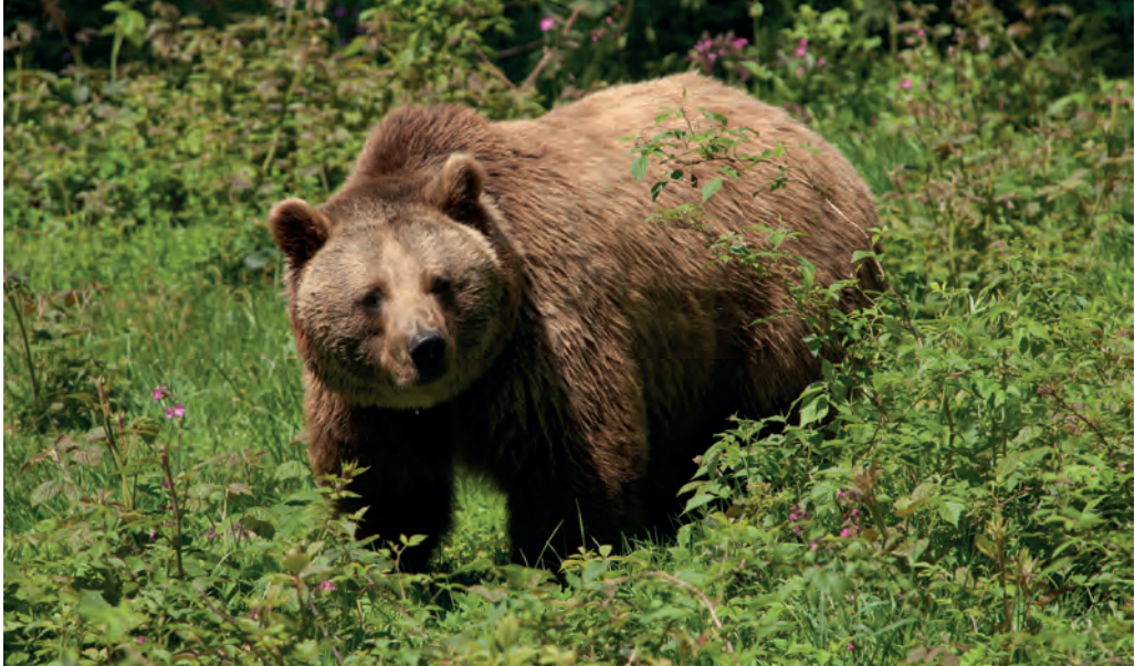
Figure 1. The brown bear (photo taken in Bayerischer Wald).

(Vader 2007, Vossen 2007). After the construction work was completed, a bare stretch of sand, the “Van Limburg Stirumvallei” (figure 2) remained, with local exposures of palaeosoils.