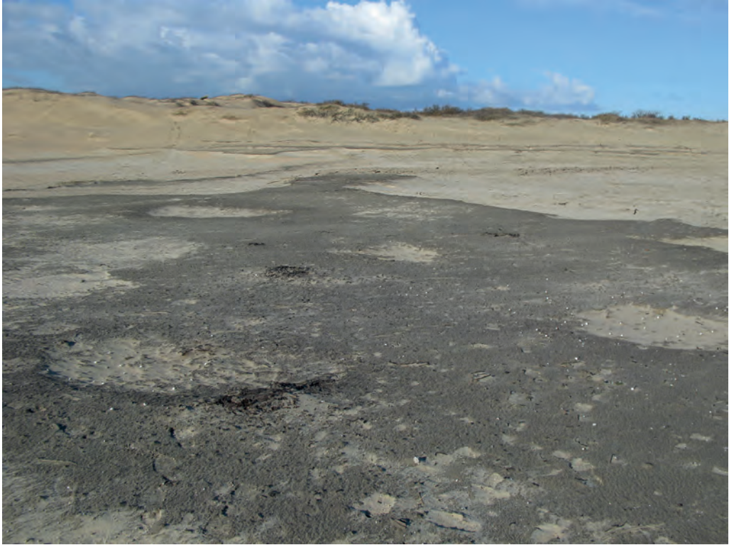
Figure 2. The research area near Noordwijk, with stub remains (black) of birches ( Betula sp.) and an alder ( Alnus sp.).