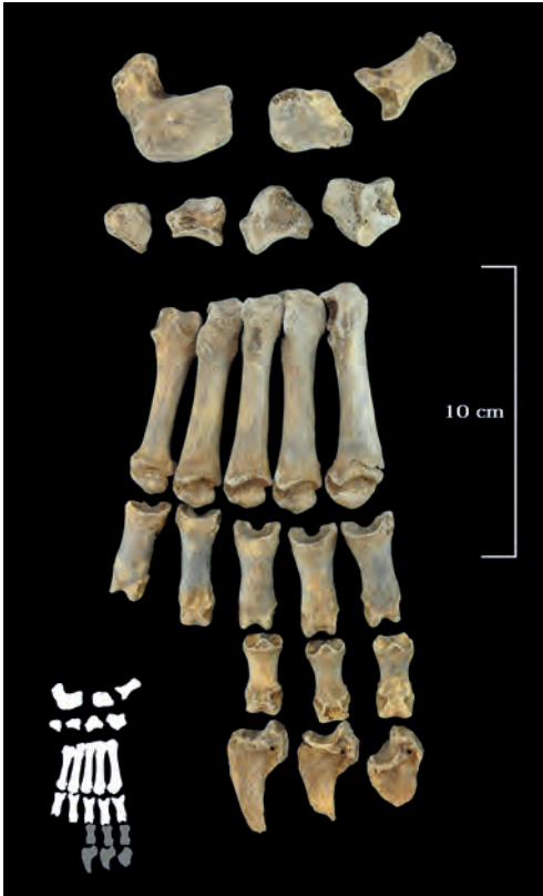
Figure 4. Left hand of the brown bear from Noordwijk (detail of figure 3). In the bottom left corner of the picture the grey fragments show the skeleton elements (distal phalanges) of which the position is uncertain.

The material was checked by A. Verbaas for macroscopic traces such as cut marks and traces of gnawing that could possibly provide insights into the taphonomic history of the find. No traces were found and this suggests an undisturbed deposition with little or no access by carnivore scavengers.