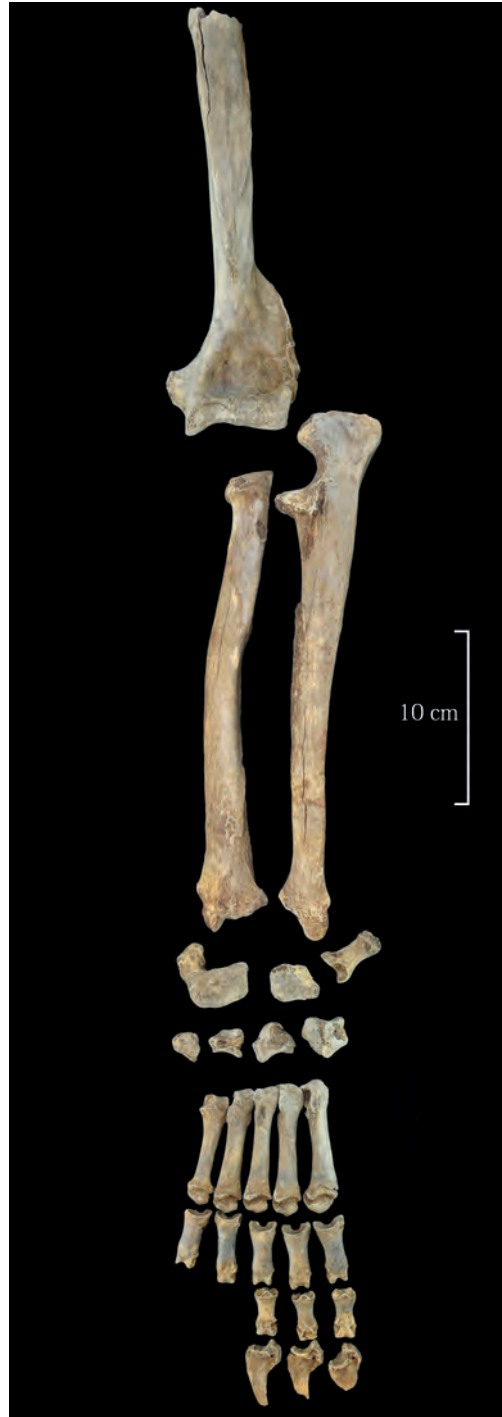
Figure 3. Left front leg of the brown bear from Noordwijk.

The skeletal material is a large portion of a left front leg. All the skeletal elements are present except for one second phalanx, two third phalanges and most of the sesamoid bones (figures 3 and 4). Overall the bones are well-preserved: most of the skeletal elements are complete and they only show slight cracking due to dehydration. The proximal end of the humerus is fragmented and the ulna partly fragmented, but all the parts are still present. Two of the three third phalanges are fragmented distally. The good preservation is indicated by the high collagen yields, taken before dating the sample. The good preservation, the representation of skeletal elements and the location of the find supports the possibility that originally, a large part, possibly a complete skeleton was preserved. Unfortunately, it was not possible to study the overlying sediments as they were removed during the restructuring of the landscape.