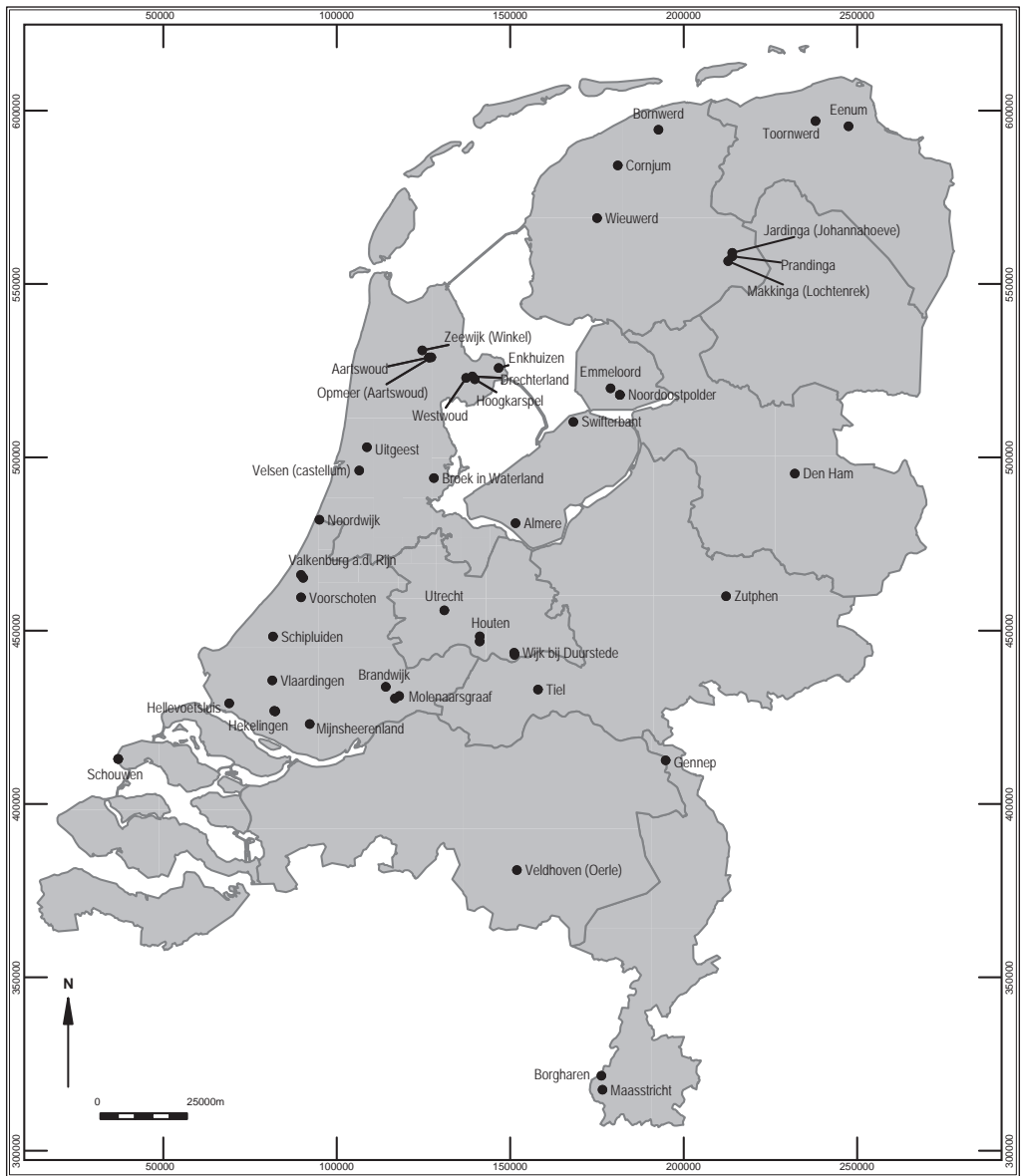
Figure 6. Map of locations in the Netherlands where Holocene remains of brown bear were found. Drawing: W. Laan (Archol).

and Luxembourg was more or less the same. It is possible that bears were still present in the southern and eastern parts in these countries until the 12 th century (Ervynck 1993).